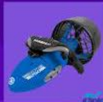
Yamaha RDS250 Sea Scooter