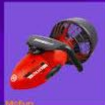
Yamaha RDS200 Sea Scooter