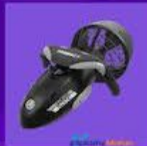
Yamaha RDS280 Sea Scooter