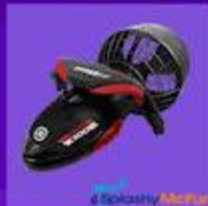
Yamaha RDS300 Sea Scooter