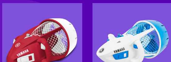
Yamaha Seal Seascooter