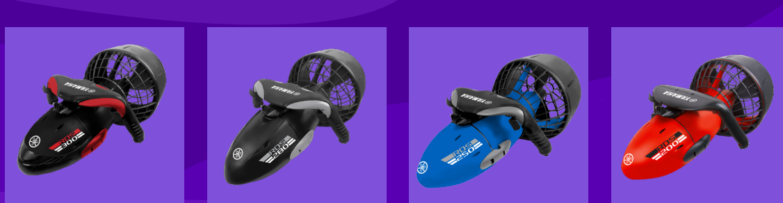
Yamaha RDS300 Sea Scooter