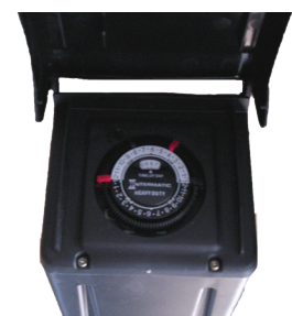
Timer & Transformer -for LED