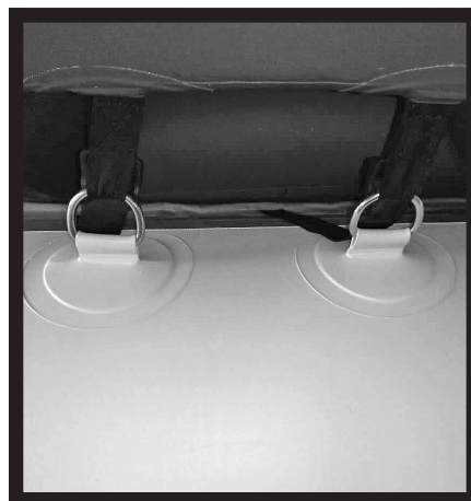
Straps connected to d-rings

To order any of these items call (888)-897-7527, or log on to our website: www.splashymcfun.com