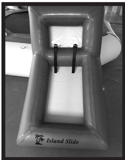
Straps under Island Slide