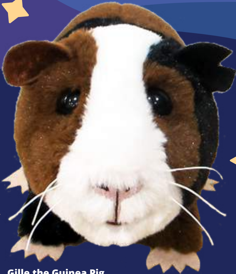
Gille the Guinea Pig

Bringing book characters to life with a plush buddy friend makes them even more real for a child.