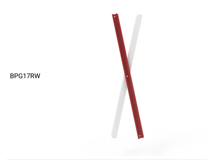
Port-a-Guard Pair of Slats Red/White