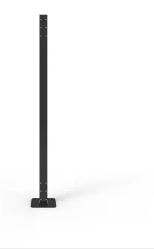
<u>Port-a-Guard Post - Powder</u> <u>Coated Black</u>