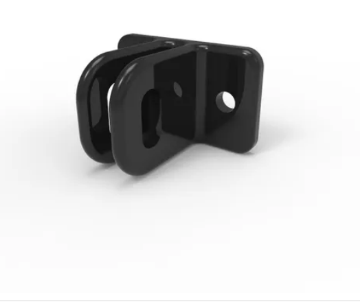
Port-a-Guard Wall Receiver Clip