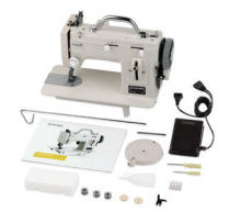
FULL ACCESSORY KIT