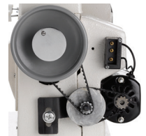
BUILT-IN SPEED REDUCER