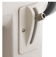
REVERSE LEVER MECHANISM