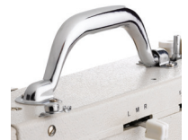
HEAVY-DUTY CARRYING HANDLE