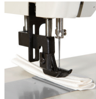
UP TO 8 LAYERS OF SUNBRELLA-PLUS