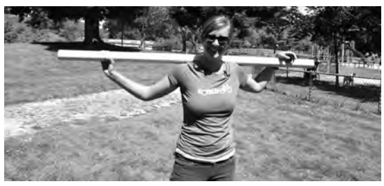
Packed up, the racks are extremely compact and easy to transport.