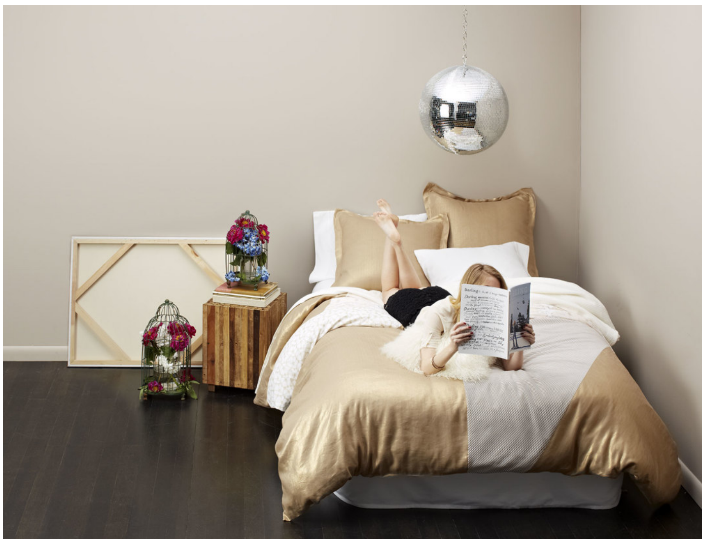
The Bailey collection by 41 Winks

The revamped 41 Winks features individualized collections , each based around a duvet cover made of a patchwork of premium textiles in soft sateen, combined with materials like seersucker and metallic linen.