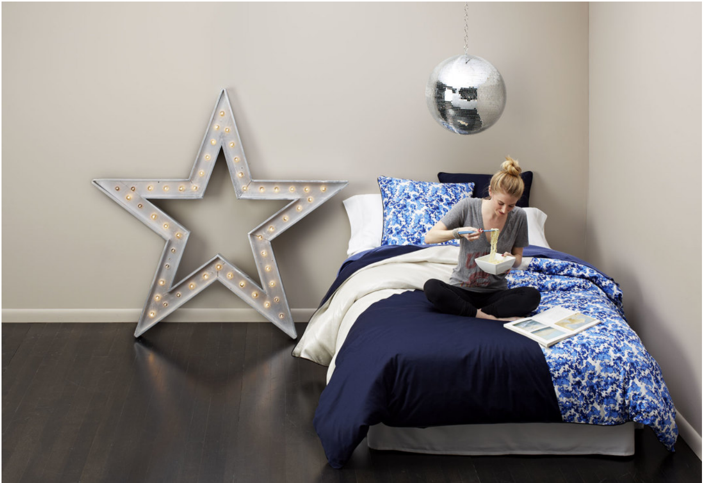
Olivia White and the Ink bedding collection by 41 Winks