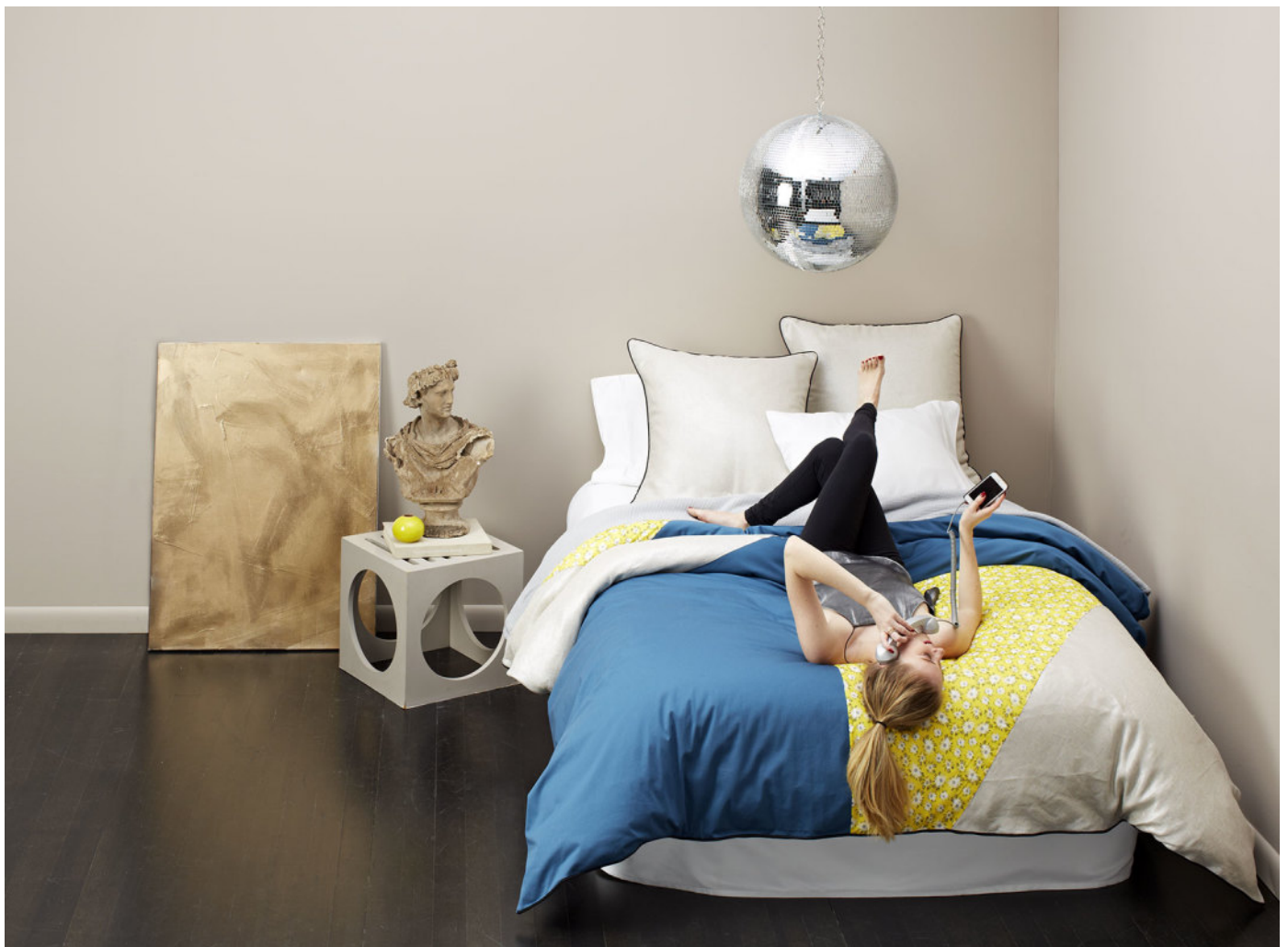
The Bond collection by 41 Winks

"College is a crucial time to be loud and expressive," says White. "Bedding is representative of who you are, it should be something you care about—it's the biggest element in your space."