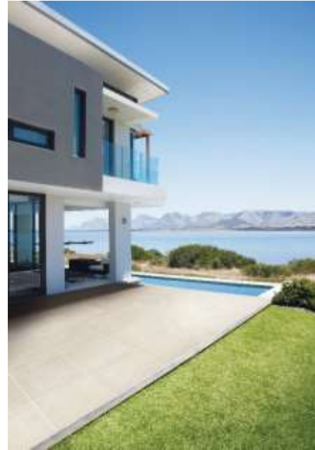
Xtra Trav Beige featured

Download Emser Tile's 34-page guide to outdoor collections available now. And coming soon, look for more announcements on new outdoor introductions later this year.