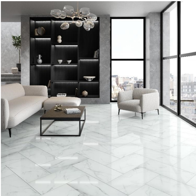
Visconde in Silver (polished) is elegant

In comparison, Nobleza ™ boasts a similar elegance with a bit more flair. Offered in 12" x24" tile and one mosaic pattern, polished or matte finishes and two timeless colorways, Nobleza with its more dramatic veining can surely create a striking statement with limitless applications. Perfect for residential and commercial indoor flooring and walls, Nobleza is sure to please a variety of taste profiles.