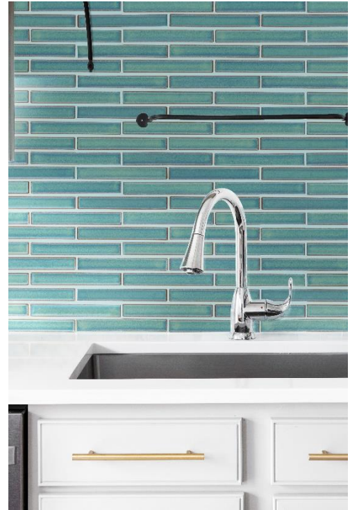
Regala in Present (colorway), Offset Mosaic (tile format)

Rounding out the new product collections are the perfect pair of Mixt™ and Fixt™ . These two collections which mimic natural building materials were designed to complement each other when used in the same space, as well as stand strong when used alone. The color and design possibilities are virtually endless for Mixt™ and Fixt™ , making both collections ideal for mixing and matching.