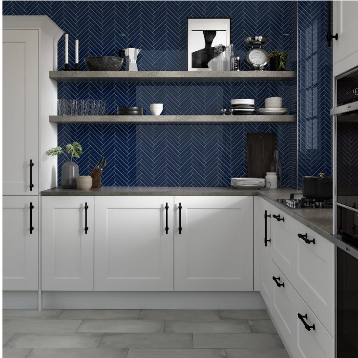
Regala in Token (colorway), Herringbone Mosaic (tile format)

For a timeless yet eye-catching look, Regala™ contrasts visual intricacies with calming hues of cream, green and blue. This glazed porcelain tile is available in Herringbone and Offset mosaic patterns, along with a special mini version of each, and offers a perfect pop of interest to backsplashes or statement walls alike.