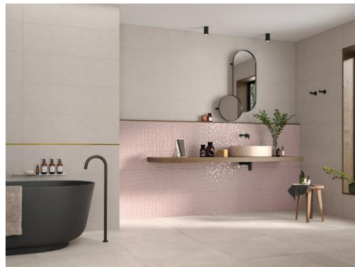
Sparkle in Rose

This playful large format tile provides a hint of glittery light that enlivens any space. The fun pattern and texture of Sparkle™ glazed ceramic in combination with the large format size, adds personality to any room. And the four contemporary colors are versatile and work beautifully with any design theme.