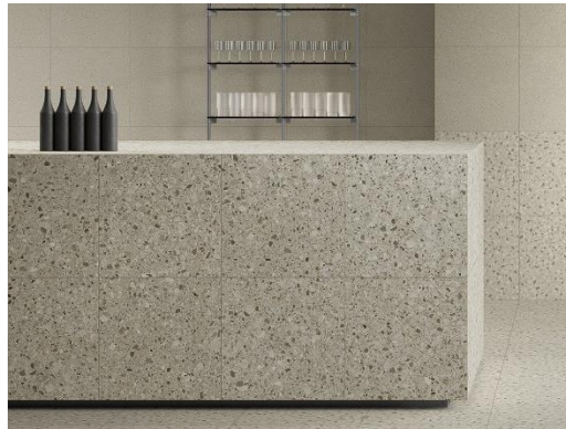
(Shown left to right): Mixt Mineral in Light Greige and Mixt Flake in Light Greige glazed porcelain

Inspired by the world's finest marbles, Parkview™ glazed porcelain offers traditional marble looks with classic whites and the deepest blacks as well as unconventional marbles with its deep, rich cobalt blue. Parkview Outline provides a unique blend of these colors to make a stunning statement.