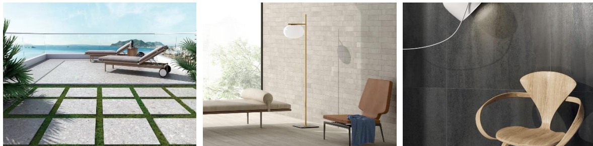
(Shown left to right): Fixt Stone, Cement and Metal glazed porcelain

Fixt™ Stone, Cement, Wood and Metal together create a stylish, yet highly functional space, for any project. Multiple sizes and colors for both floors and walls, added features like R11 Anti-Slip and EmGuard™ Anti-Microbial finishes, all for both indoors and out, are available. That level of flexibility is a key tenet of the Enhance collection.