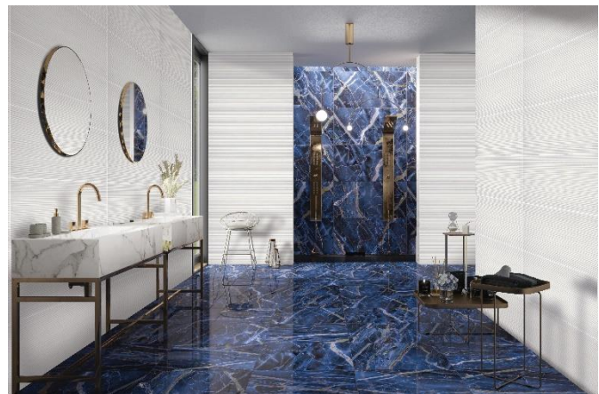
Style Statement: Parkview in Blue adds boldness and depth