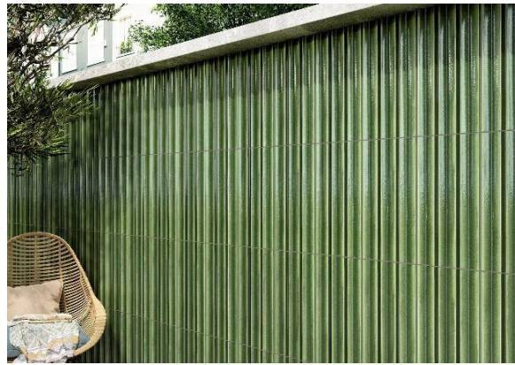
Textural Movement: Shadows play off Tubage in Green

Textural Movement includes multi-sensory materials, raised and recessed features and unique imperfections that all play with light and shadow. An often underused design tool, texture variations within a space can bring everything together as one. Layers of texture make a space feel immersive and add a sense of wonder. Newly released Tubage™ from Emser promotes a play of light through rhythmic grooves and scalloped dimension. Tubage is an extruded porcelain which is a specialized production process that creates a high-quality three-dimensional tile. This provides a more natural look with slight variation between tiles offering the beauty of artisanal imperfection.