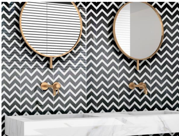
Style Statement: Bizou Chevron in Black and White is striking and iconic

Where Bizou™ wows with its intricate details, Parkview™ is a true showstopper. This large format tile creates a sense of glamour within a space and can be used from floor to wall, for a seemingly endless look of luxury.