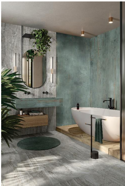
Wellness Wonder: Livorno in Ulivo creates a luxurious oasis

Al Fresco Attitude celebrates beautiful outdoor living spaces that have been gaining momentum in recent years. Outdoor living in 2023 will continue to focus on seamless indoor to outdoor transition spaces with indoor amenities brought outdoors, such as full kitchens, showers, and fireplaces – all with an emphasis on comfort, style, and socializing. Pools will continue taking center stage, and marrying the look within these outdoor amenities will provide that desired spa-like feel. Perfect for the pool as well as the outdoor kitchen area, Swirl™ adds elegance with eight colors and two patterns. This molten glass mosaic offers richness and depth, while blending in with the surrounding natural environment.