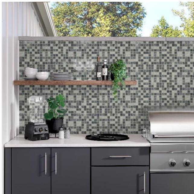
Al Fresco Attitude: Swirl in Fog brings richness to this outdoor space