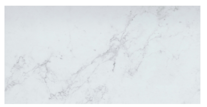
White | 12x24