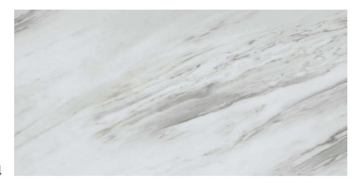
Milk | 12x24