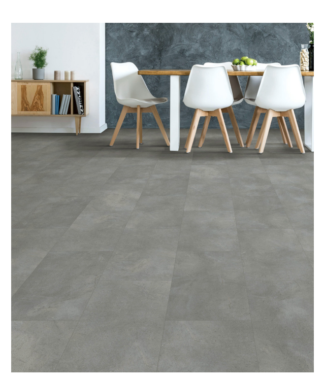
Cream | 12x24