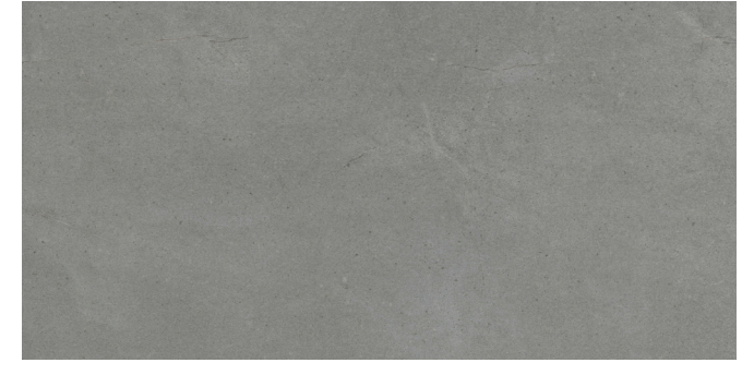
Gray | 12x24