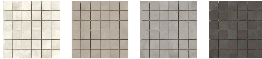
White 2"x2" on 12"x12" Mesh Beige 2"x2" on 12"x12" Mesh Gray 2"x2" on 12"x12" Mesh Black 2"x2" on 12"x12" Mesh

All Diagonal Colors are Available in Left & Right