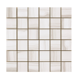
Era 2"x2" on 12"x12" Mesh