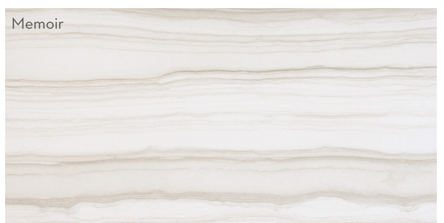
All Colors Available in Size 11"x23"