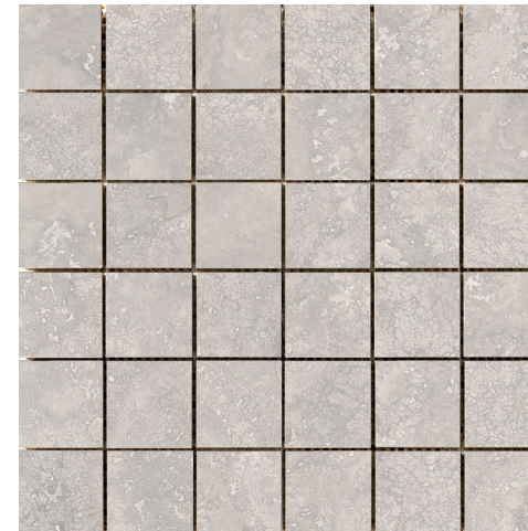
Gray 2"x2" on 12"x12" Mesh