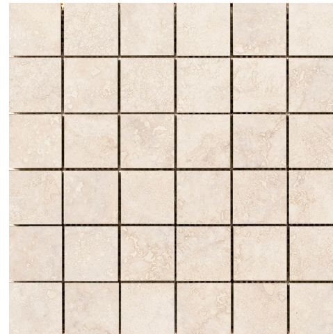
Sand 2"x2" on 12"x12" Mesh