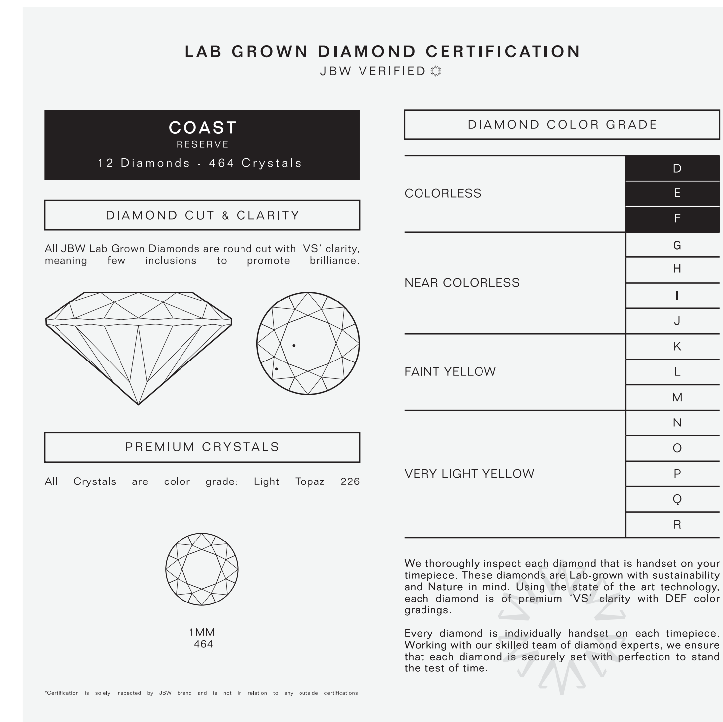
LIGHT TOPAZ 226 SWAROVSKI R6402B