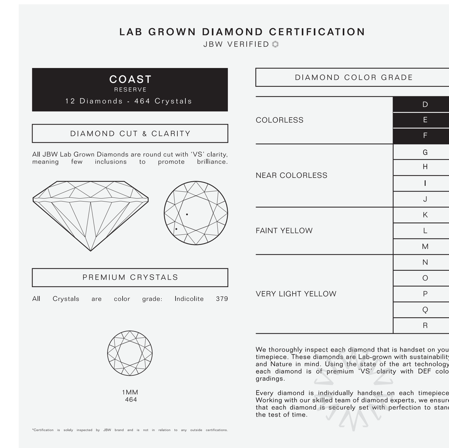
INDICOLITE 379 SWAROVSKI R6402B