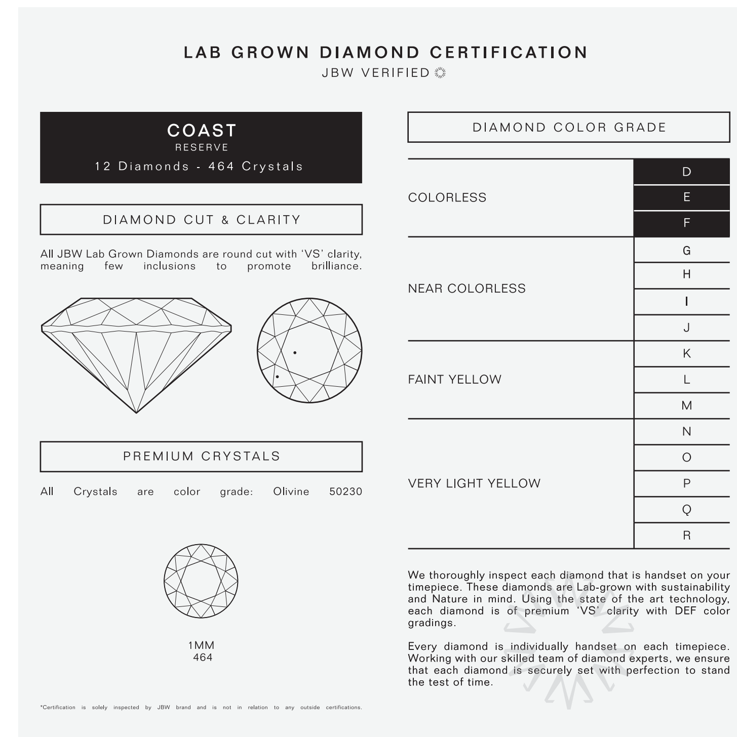
OLIVINE 50230 PRECIOSA R6402A