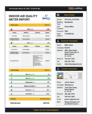
E-mail a report to contacts stored in the app

Designed for use with APPLE® products. APPLE® is a registered trademark in the United States and other countries. Designed for use with Android® products. Android® is a registered trademark in the United States and other countries. Bluetooth® is a registered trademark in the United States and other countries. All trademarks are owned by their respective