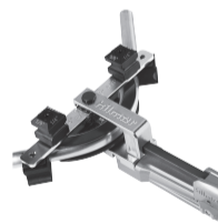
Figure C Product Set-up