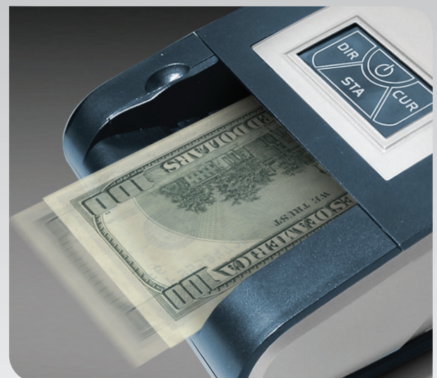
Automatic multi-orientation feeding