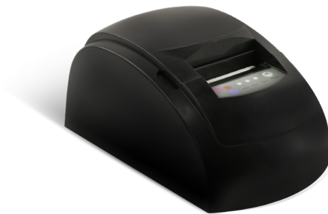
Compatible with MP20 Printer Optional / sold separately

UPC Numbers D700: 097241587001 / D700 with Printer: 097241037001