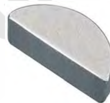
No. 6504 "Fix-Kit" Woodruff Keys 1035 Carbon Steel 20 Varieties - 383 Pieces