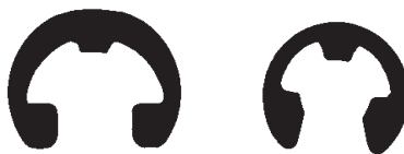
No. 6508 "Fix-Kit" "E" & Reinforced "E" Rings Groove Required 24 Varieties - 1500 Pieces