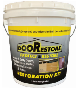
Mix chemicals and water in Reusable Bucket