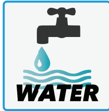
1 Gallon WATER