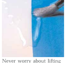
paint that needs to remain pristine in subsequent washes and wettings with Da Vinci Fluid Acrylic, even with pigments such as Cerulean Blue