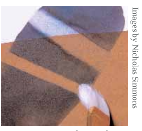
Get creative with combinations of mediums: Da Vinci Fluid Acrylic when you don't want lifting and Da Vinci Artist Watercolor when you desire lifting capability