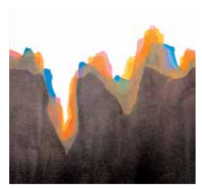
Use Da Vinci Fluid Acrylic to obtain watercolor results. and build transparent layers without disturbing crisp, clean edges