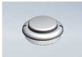
Back cap No.210059