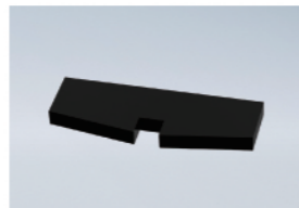
Motor blades No.311041