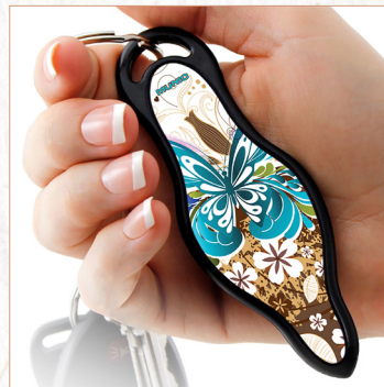
DESIGN: Brownie SKU: 015-BR