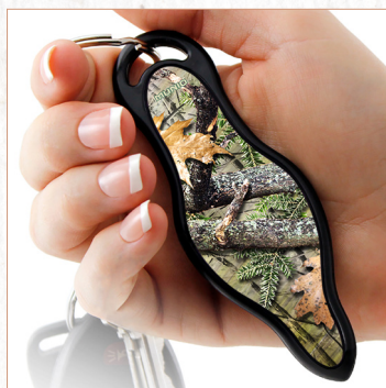
DESIGN: Natural Camo SKU: 040-NC