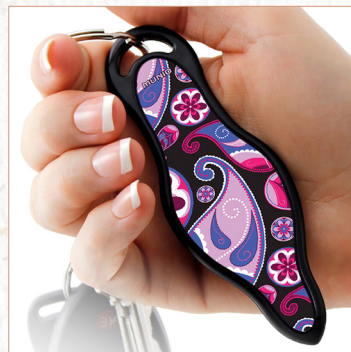
DESIGN: Pink Paisley SKU: 007-PP