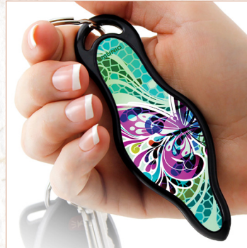
DESIGN: Butterfly Glass SKU: 031-BG