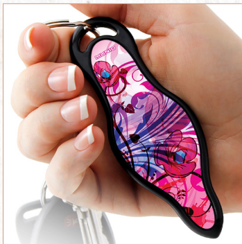
DESIGN: Spring Breeze SKU: 018-SB