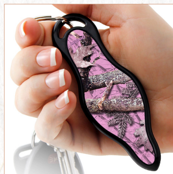
DESIGN: Natural Camo PINK SKU: 041-NP