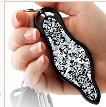
DESIGN: Damask SKU: 020-DA