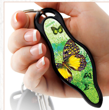
DESIGN: Butterfly SKU: 001-BU