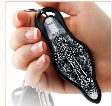
DESIGN: Cross SKU: 038-CR