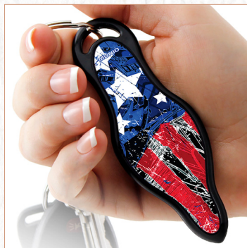
DESIGN: Urban Patriot SKU: 006-UP