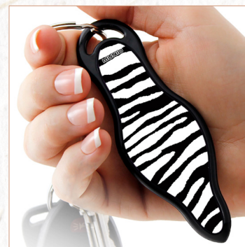
DESIGN: Zebra SKU: 004-ZE