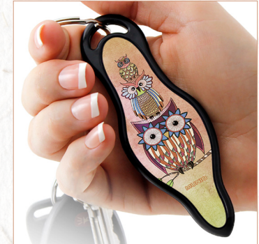
DESIGN: Triple Hoot SKU: 042-TH