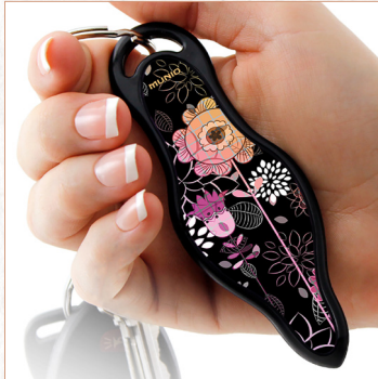
DESIGN: Modern Flowers SKU: 017-MF