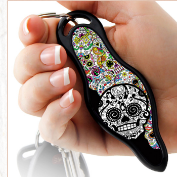
DESIGN: Sugar Skulls SKU: 035-SS