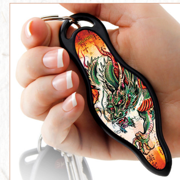
DESIGN: Dragon Legend SKU: 026-DL