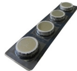
Battery Pack Strip

Comfortable stretch nylon band with adjustable head that can be attached to any Guardian to make an effective head light. Can also be adjusted to fit wrist for hands free lighting.