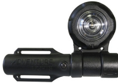
Powergrip Adaptor Cap P/N: 99033 (add -TAN for Tan)

Allows attachment to reclosable fastener such as hook and loop. Comes with all necessary hardware and patches.