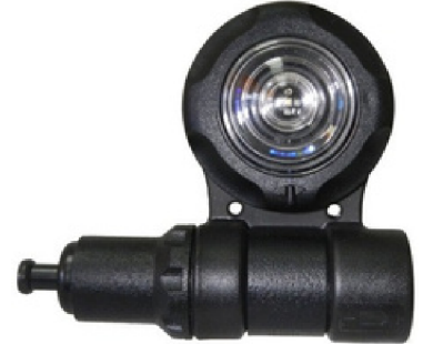
Trip Wire / Trigger Cap P/N: 99006

Triggers VIP light when magnetic plug is pulled off of cap.