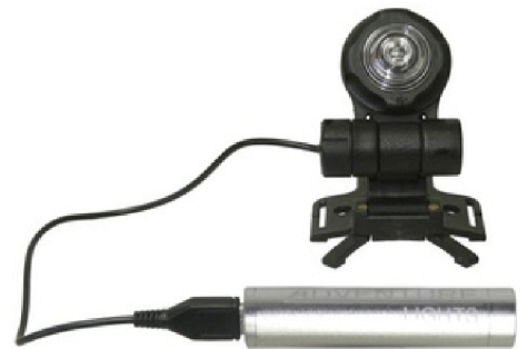
USB Power Cap P/N: 99034

Adapts VIP battery source to two lithium or alkaline AA batteries, increasing overall run time.