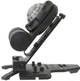
Universal Mount P/N: 99001

Multi-purpose mounting unit. Can pivot VIP 180 degrees in ten 18 degree steps.