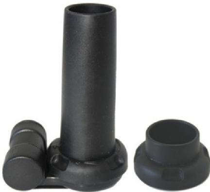
Light Shield P/N: 99010 (Long) (add -1 for Short)

Triggers VIP light when magnetic plug is pulled off of cap.