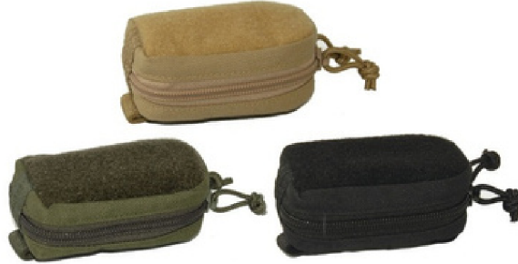
Light Pouch P/N: 99002 (Tan) (add -1 for Green; -2 for Black) MOLLE compatible. Designed for VIP. Available in three colors.

Multi-purpose mounting unit. Can pivot VIP 180 degrees in ten 18 degree steps.