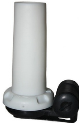
Light Diffuser P/N: 99011

Allows only directional viewing of VIP light. Long (18°) or Short (30°).