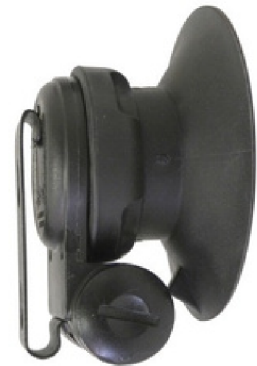
Window Mount P/N: 99014 (clear lens) (add -IRBK for IR black lens)

Makes VIP light signature larger by providing an even glow for viewing from the side.