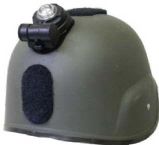
Helmet Mount P/N: 99030-DL (add -TAN for Tan)

Attaches VIP to glass surface. Available with clear lens or IR specific black lens.