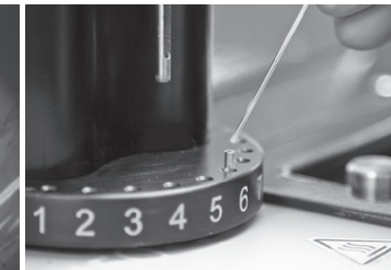
Break TAG into vial