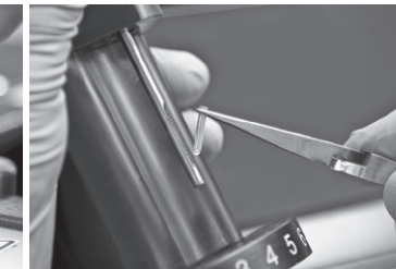
Drop vial into PSI-Probe