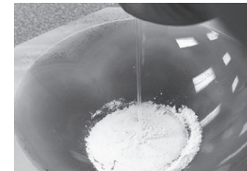
Collect sample with TAG

The GERSTEL-Twister is a unique sampling tool. It is fast, eliminates the need for solvents, and is up to 1000 times more sensitive than SPME. It uses SBSE (stir bar sorptive extraction) to collect organic compounds directly from liquid samples, like drinking or waste water, bodily fluids, or beverages. The Twister adsorbs and concentrates the organic contents onto its sorbent coating. Solid and vapor headspace samples can also be tested via Twister. Simply drop the Twister in a sample vial containing the liquid or solid and seal the vial. Then place the Twister vial on a stir plate. Remove, rinse, dry, and drop the SBSE into the PSI-Probe for thermal extraction and subsequent GC/MS analysis.