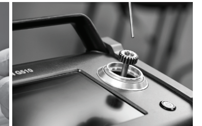
Insert PSI-Probe into injector port