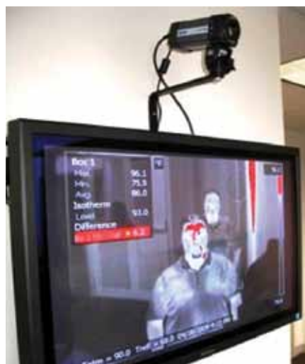
Fixed-mount FLIR A320 with the color alarming in progress

Infrared thermography provides a visual map of skin temperatures in real time. In addition, IR cameras are very sensitive devices. FLIR cameras measure temperature differences as small as 0.07 °C.