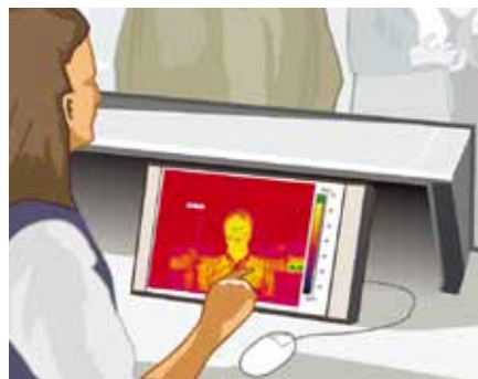
Step 2: IR camera operator looks at a color monitor that shows audible and/or visible color alarms when an individual shows an "out of norm" body temperature.