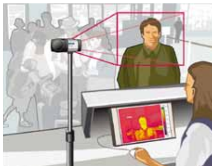
Step 1: Individuals are remotely monitored as they pass a screening check points set up at an airport, border, or in the entrance lobby to a corporation or school.