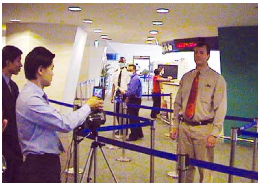
Setting up a FLIR IR camera with Automatic Temperature Compensator (ATC) for elevated body temperature detection

Still, skin temperature is affected by one’s surroundings, even if they have a fever. Nevertheless, their skin will be hotter than other nearby persons (affected by those same surroundings) who do not have a fever. FLIR’s unique Automatic Temperature Compensator feature takes this