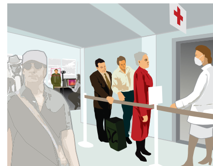
Step 3: Persons with an elevated body temperature are sent to a separate line for further screening by a healthcare professional or designate.

into account and improves the reliability of temperature measurements.