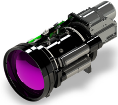
Neutrino LC - ISR 20-420