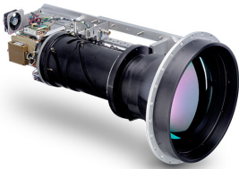
Neutrino SX12 - ISR 1200