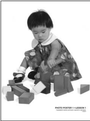
Photo Poster 1

Show Photo Poster 1. Point to the girl in the picture. Here is a girl playing with blocks. What is this? Point to the hammer. What do you do with a hammer and blocks? Be prepared to do actions such as hammering, stacking, etc. Encourage children who are not yet talking to point or act out what they want to share. What do you think she is building? Encourage all children to share answers, even if it is only one word. This lets them share what they know. Today we are going to talk about how God told Noah to build a boat.