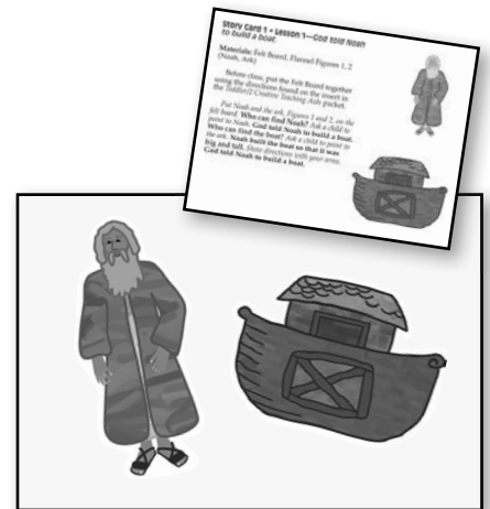
Story Mat with Story Figures 1, 2, and Story Card 1

Repeat this story with each group of children, even if there's only one child.