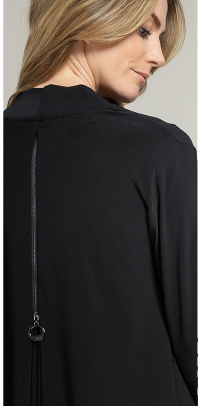
25129X Zest Zip Back Cardigan, Black 21155 Trapeze Tank, Graphite 2748L Narrow Pant Long, Black