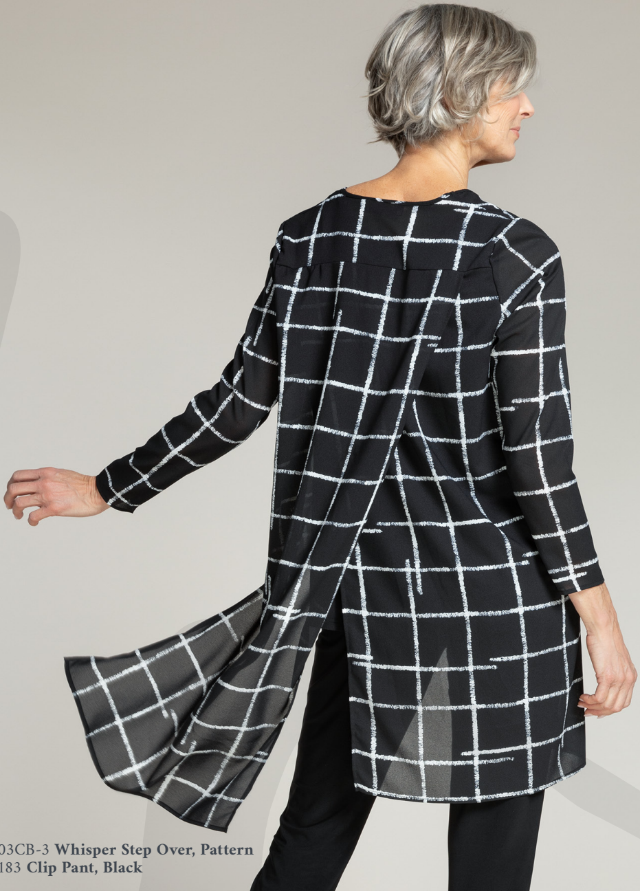
9303CB-3 Whisper Step Over, Pattern 27183 Clip Pant, Black