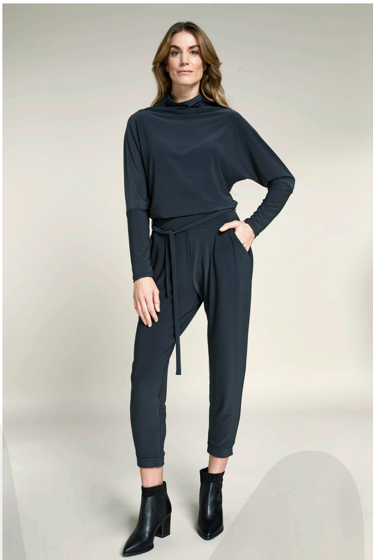
22219-3 Funnel Neck Dolman T, Graphite 27211 Wander Jogger, Graphite