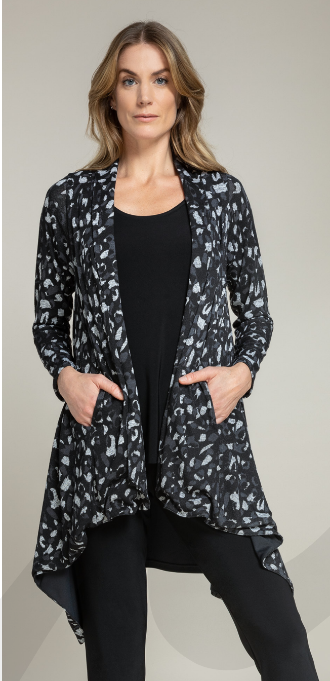
K7524A Cats Meow Cardigan 21120RS Go To Tank Relax, Black 2742 Legging, Black