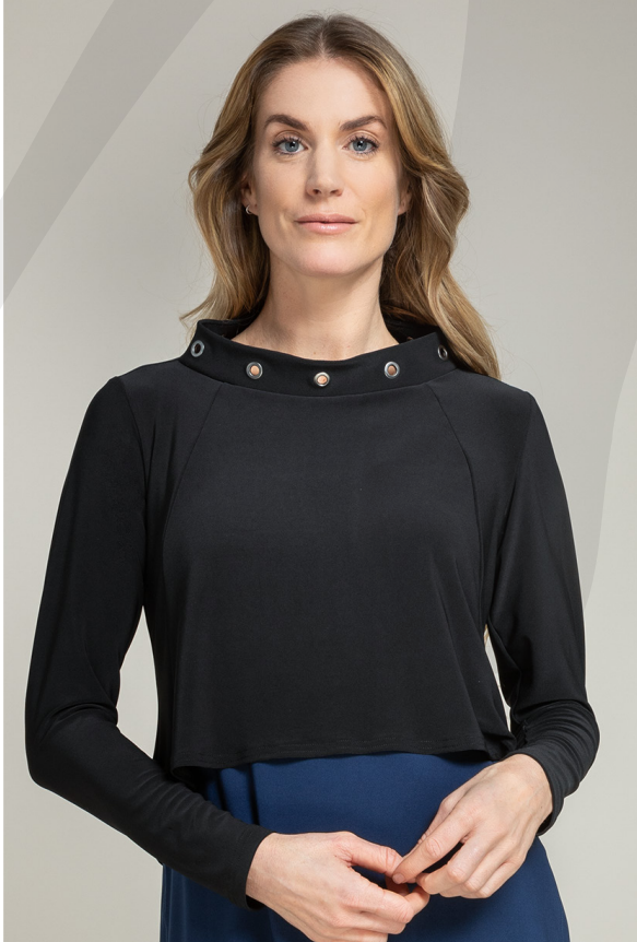
22221X-3 Halo Shorty Top, Black 21120R Go To Tank Relax, Denim