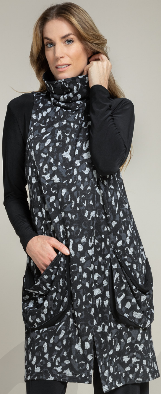
K7111A Cats Meow Vest 22217X-3 Zest Rapt T Long Sleeve, Black