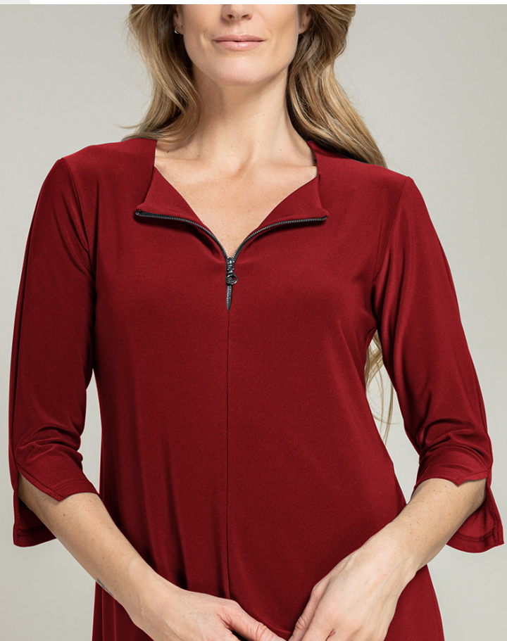
22216X-2 Zest It Up T, Brick