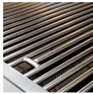
EXPANSIVE GRILLING SURFACE