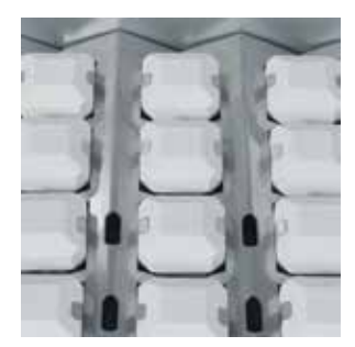
CERAMIC RADIANT BRIQUETTES