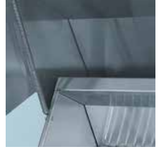
LYNX HOOD ASSIST