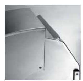
HEAT STABILIZING DESIGN