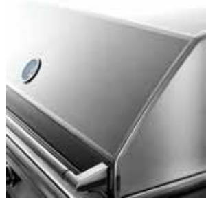
SEAMLESS WELDED CONSTRUCTION