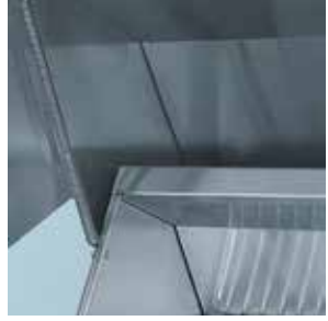
LYNX HOOD ASSIST