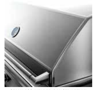
SEAMLESS WELDED CONSTRUCTION