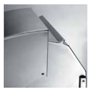
HEAT STABILIZING DESIGN