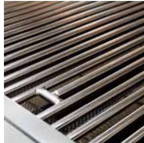
EXPANSIVE GRILLING SURFACE