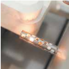
HOT SURFACE IGNITION