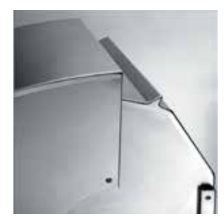
HEAT STABILIZING DESIGN