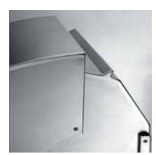
HEAT STABILIZING DESIGN