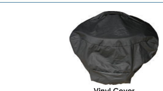
Vinyl Cover For Protection 12-0103-AC