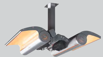
DSHCMB Ceiling-mount Bracket