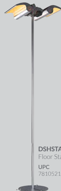
DSHSTAND Floor Stand