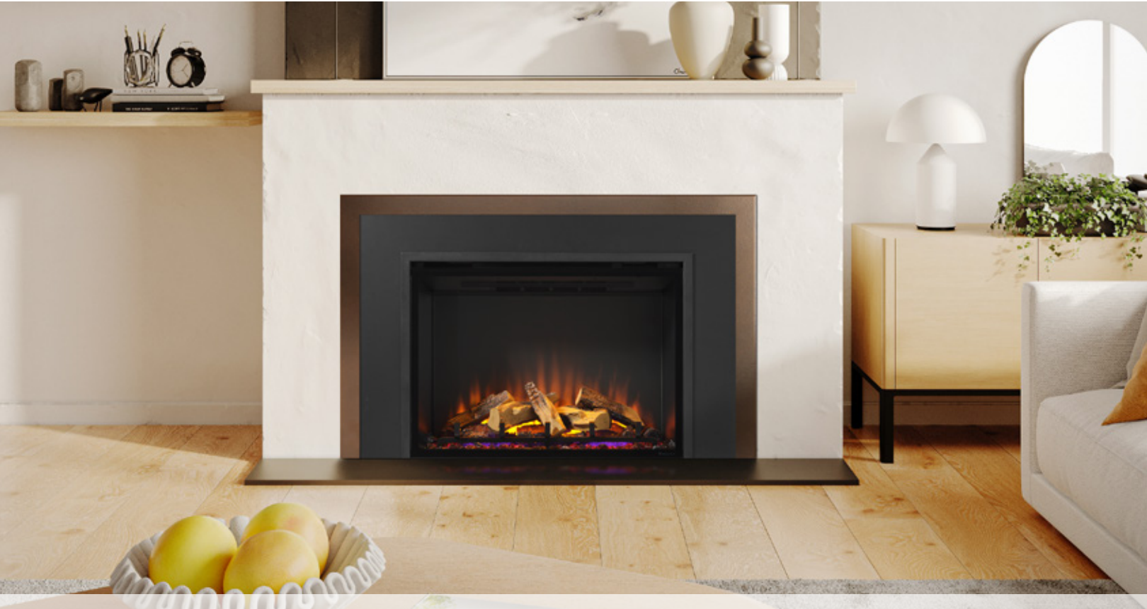
Ei33 shown with 3 sided flush faceplate, sunset bronze surround and split oak log set.

We're thrilled to unveil the latest evolution of our beloved Ei29 – the Ei33! Prepare to be blown away as we take innovation to new heights with this larger, more impressive version of our fan-favorite. The larger size means more immersive flame visuals, making it the ultimate choice for new construction or renovations. Don't sacrifice style for size – the Ei33 boasts a sleek and sophisticated design that complements any space, making it a statement piece in your home.