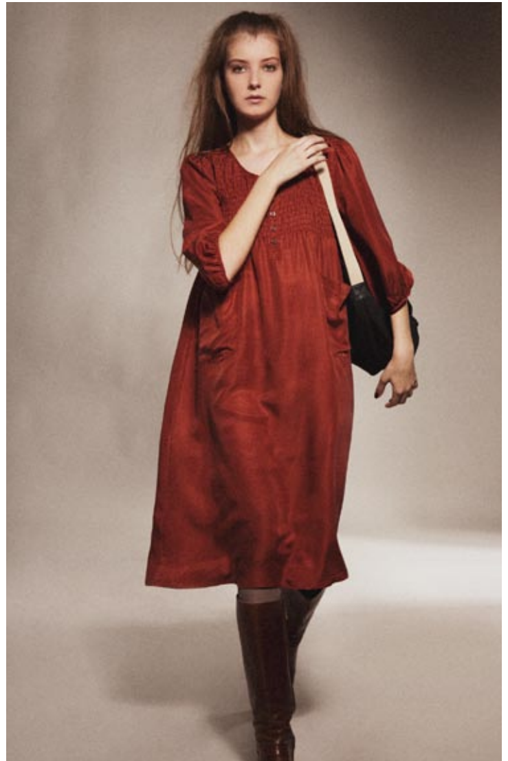
45 BAUHAUS SMOCKED DRESS