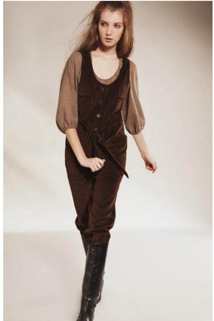
09 WOOL VOILE SCOOP TOP, CORDUROY ONE PIECE