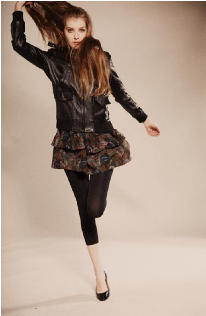
30 LEATHER, KLEE FLORAL RUFFLE DRESS