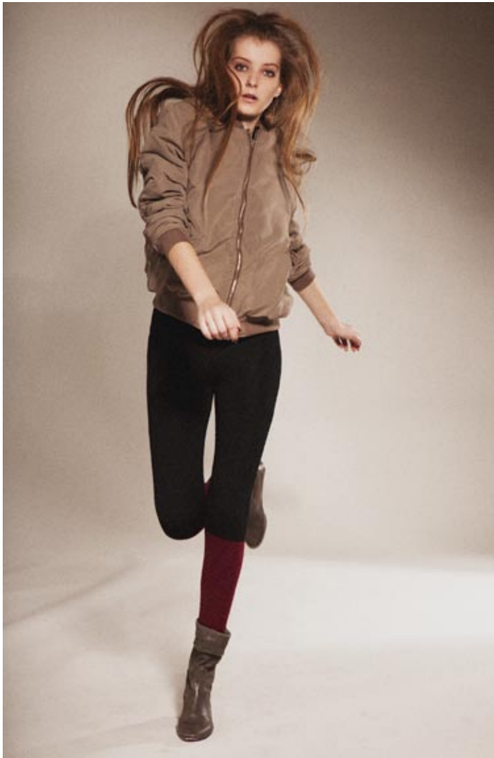
18 RIOT BOMBER, STRETCH WOOL TWO TONE LEGGINGS