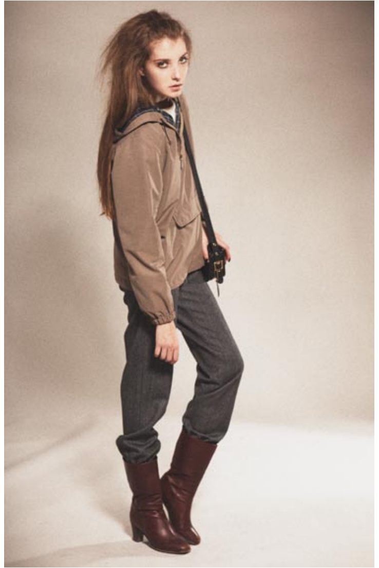
51 RIOT PULLOVER, KOKO FLANNEL TRACK PANTS