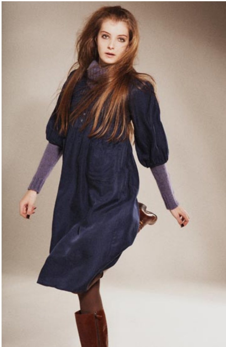
04 MOHAIR COWLNECK, BAUHAUS SMOCKED DRESS