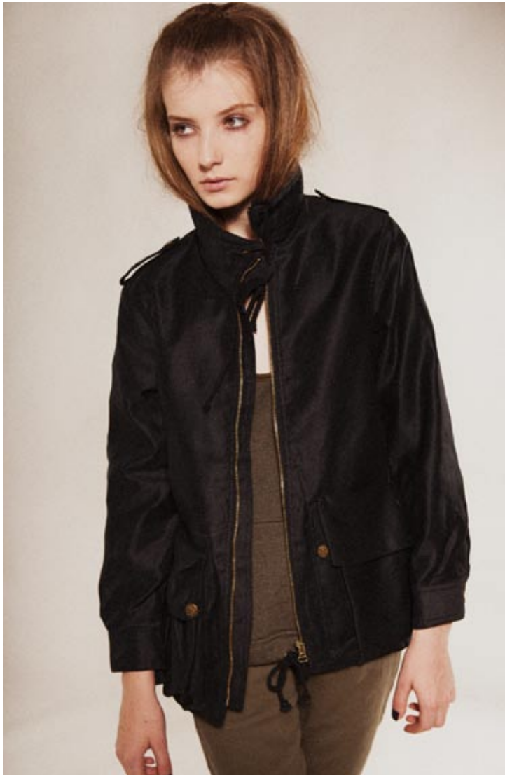
42 DESSAU CLOTH TRAIL JACKET, KANGAROO TOP, FRONTLINE TWILL SLACKS