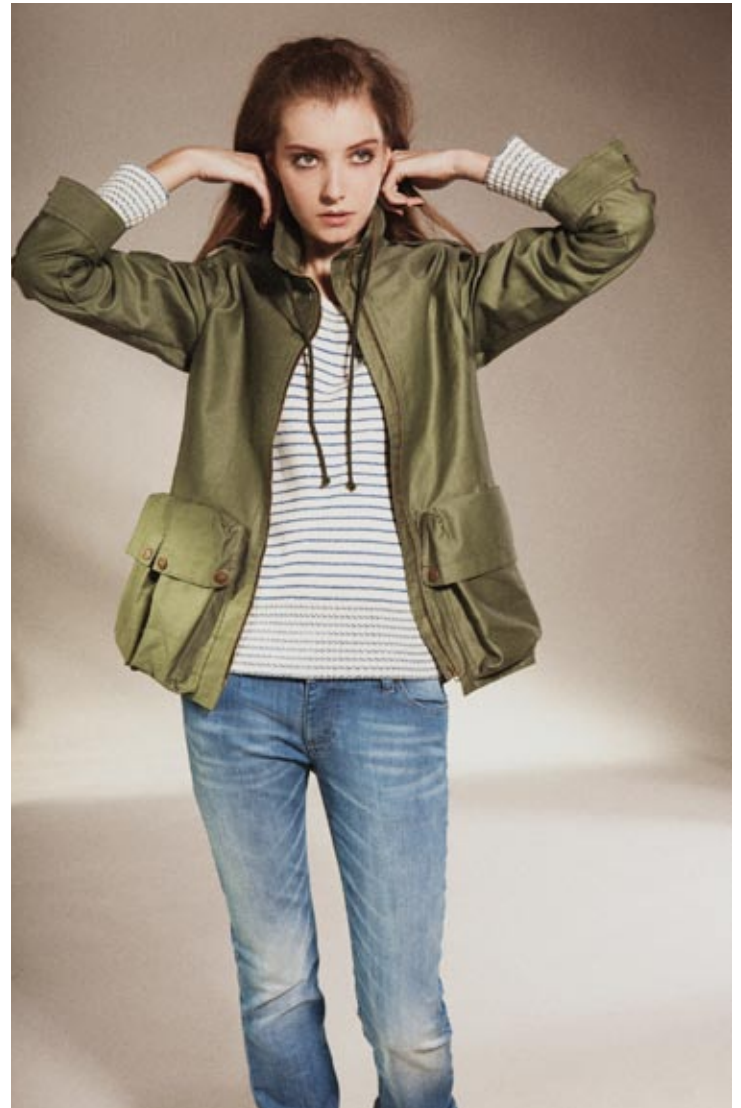
05 DESSAU CLOTH TRAIL JACKET, ARMED FORCES STRIPE DEEP U, STRETCH DENIM CIG JEANS