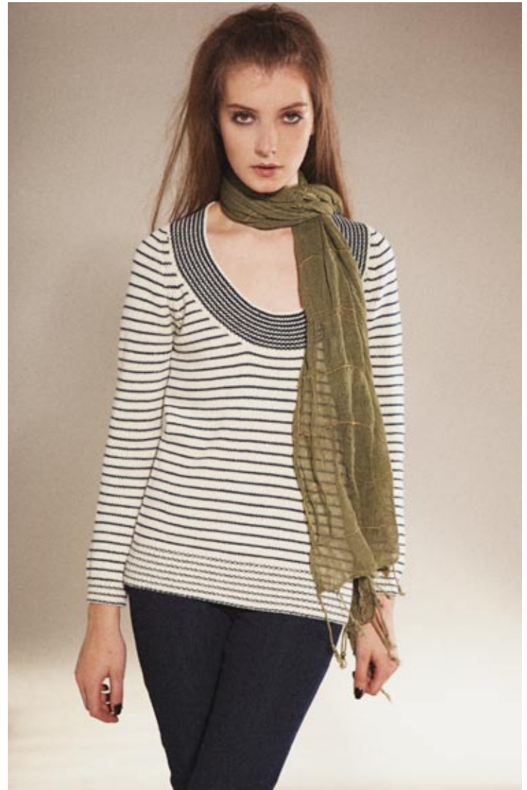
43 ARMED FORCES STRIPE DEEP U, STRETCH DENIM CIG JEANS