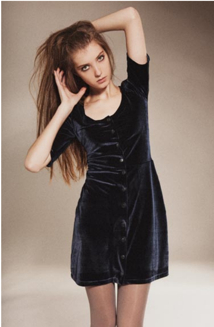
20 STRETCH VELVETEEN PARTY DRESS