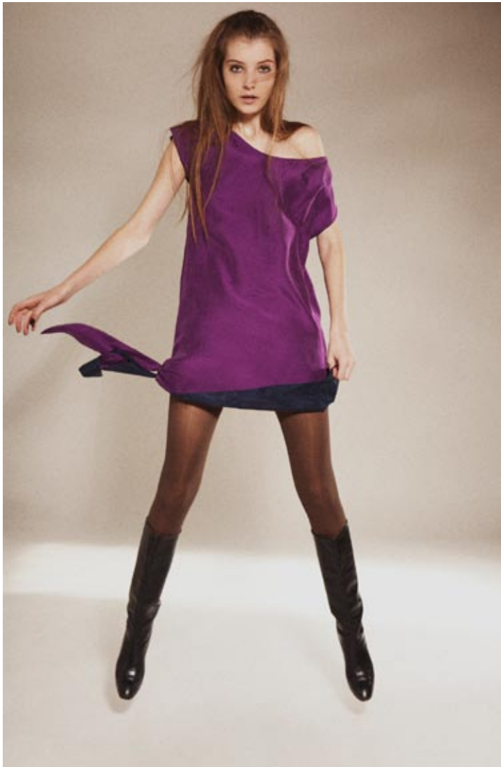
16 BAUHAUS SIDE TIE REVERSIBLE DRESS