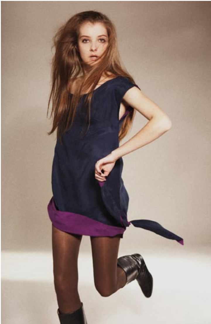
08 BAUHAUS SIDE TIE REVERSIBLE DRESS