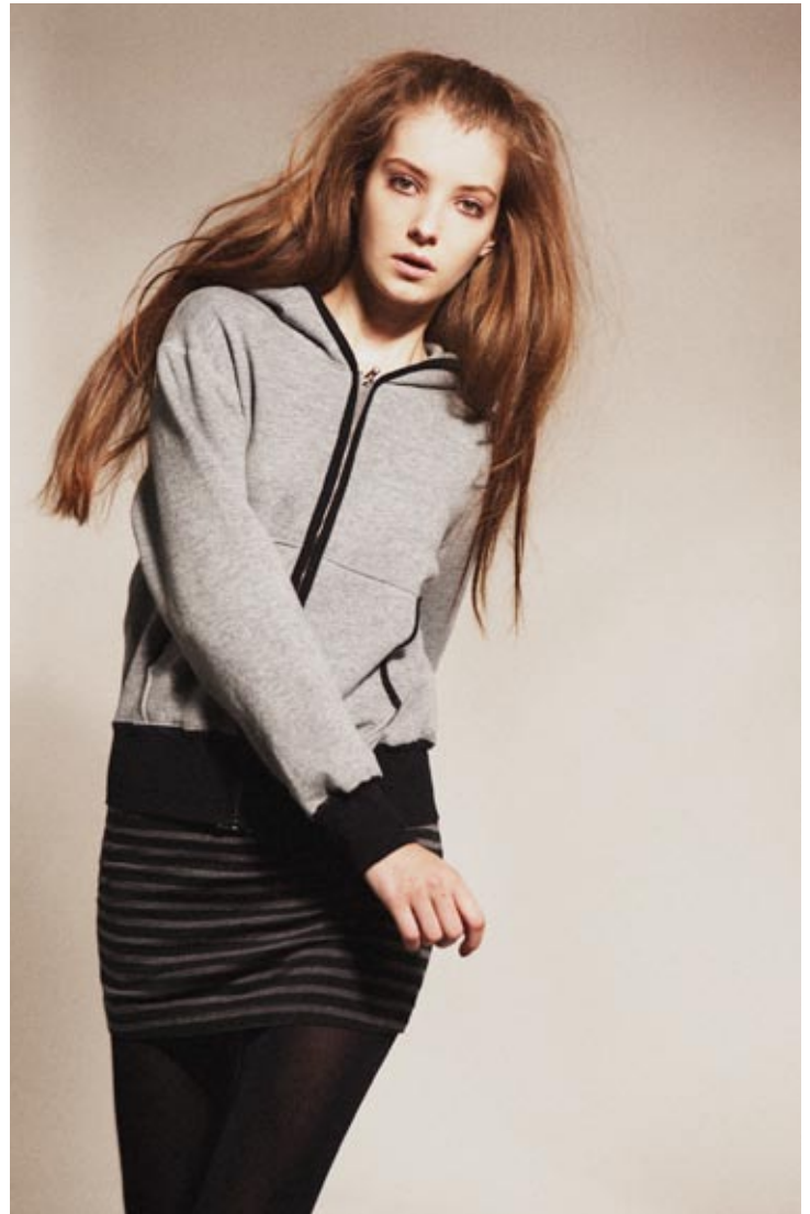
BOILED WOOL A-LINE PEACOCK, WAFFLEKNIT EMPIRE U NECK, KOKO FLANNEL TRACK PANTS