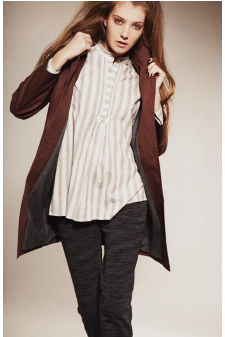
25 OVERCAST OVERCOAT, ORTHODOX STRIPE CAFE PULLOVER, BLACK HEATHER SWEATPANTS