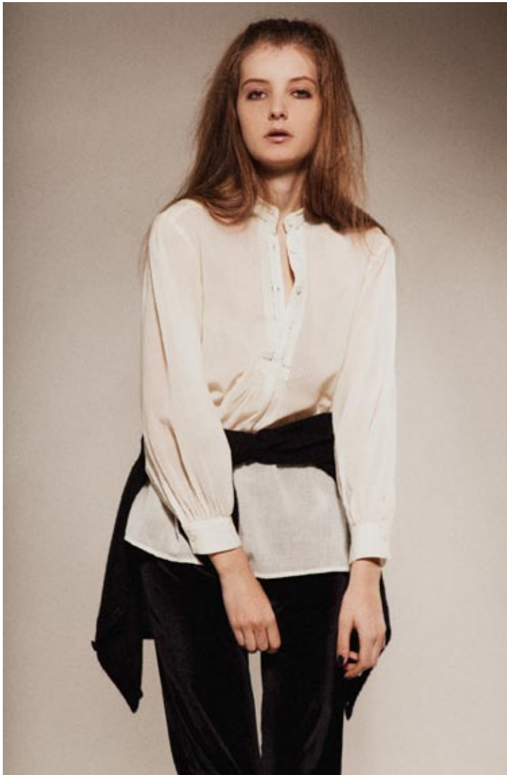
38 WOOL VOILE PULLOVER, MOHAIR CARDIGAN, STRETCH VELVETEEN LEGGINGS