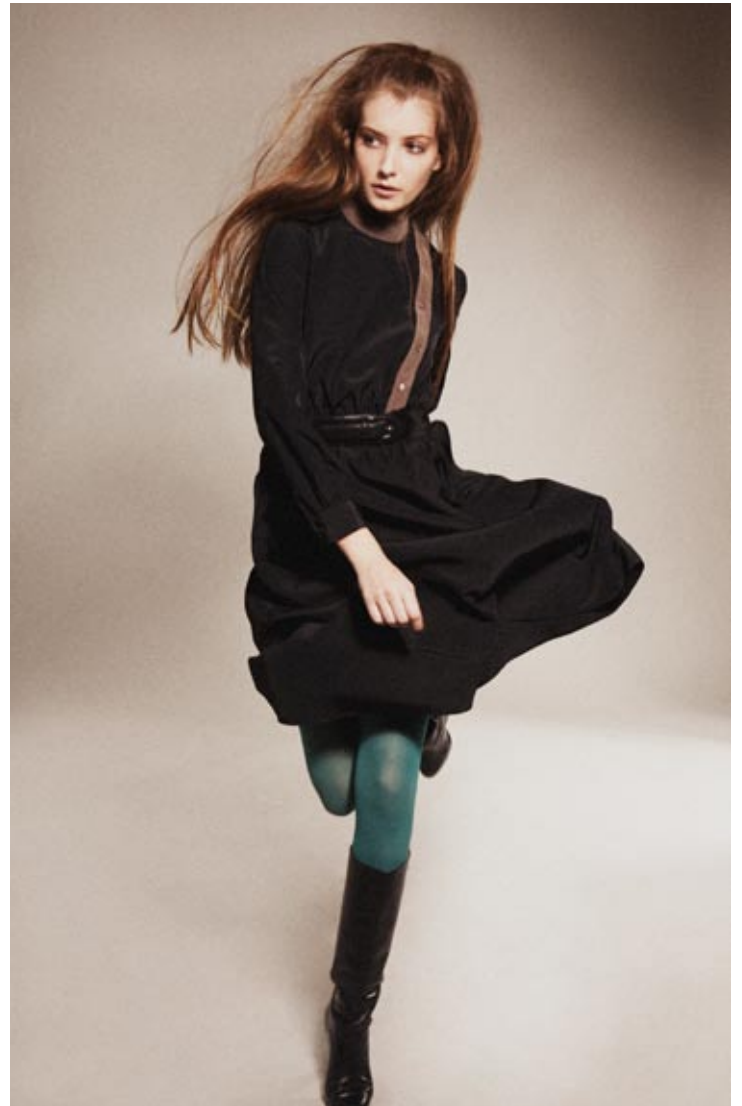
33 MIES SIDE BUTTON DRESS