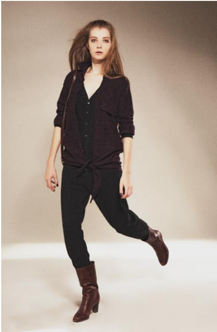
46 PLAID VOILE TIE FRONT SHIRT, STRETCH WOOL UNION SUIT