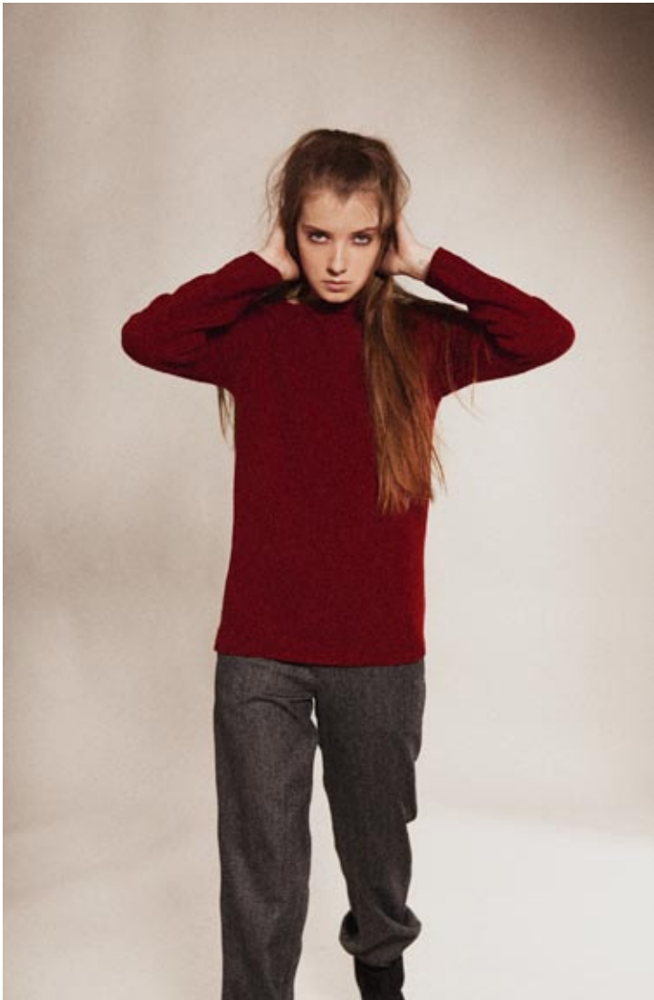
22 CAMP WOOL BOATNECK, KOKO FLANNEL TRACK PANTS