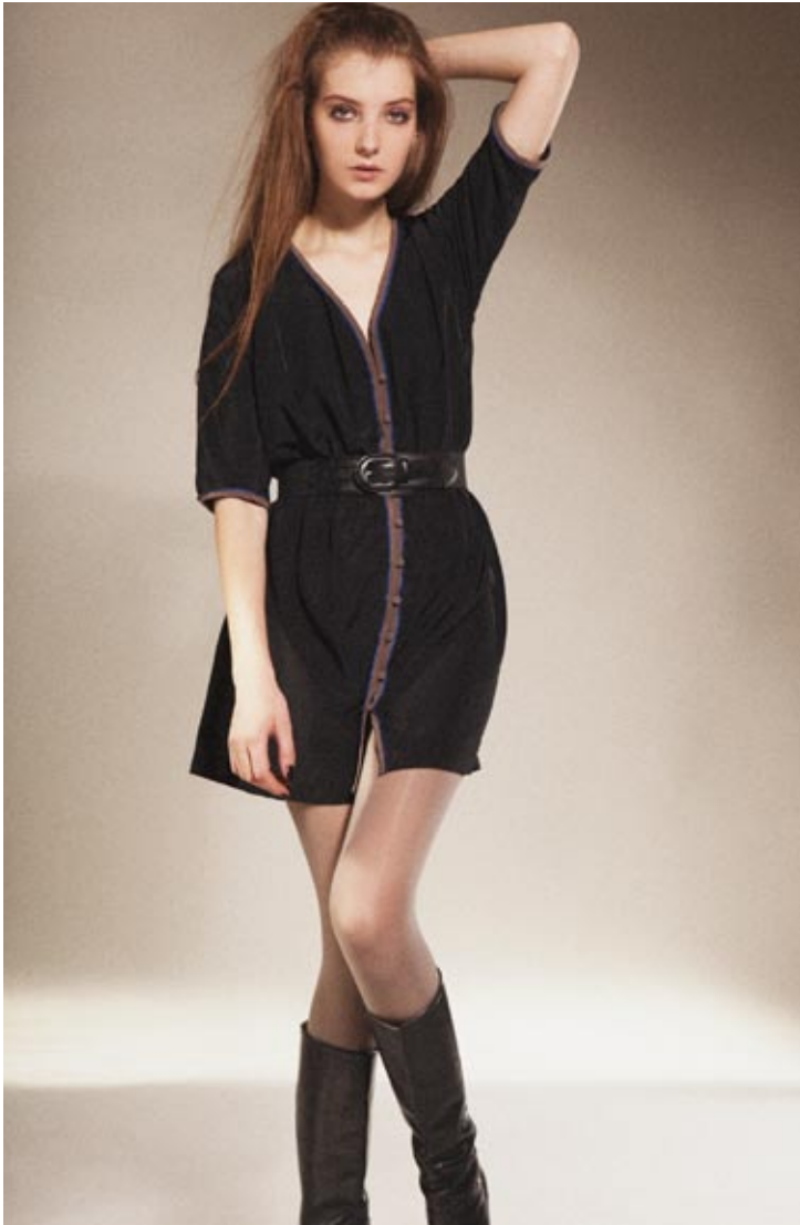
02 MIES PIPED DRESS