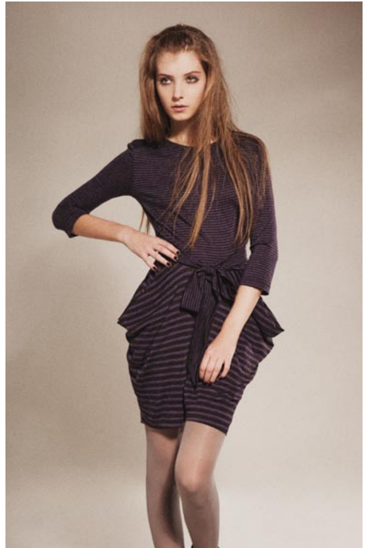
19 WEIMAR STRIPE COWL DRESS