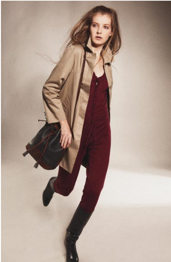
26 OVERCAST OVERCOAT, STRETCH WOOL UNION SUIT