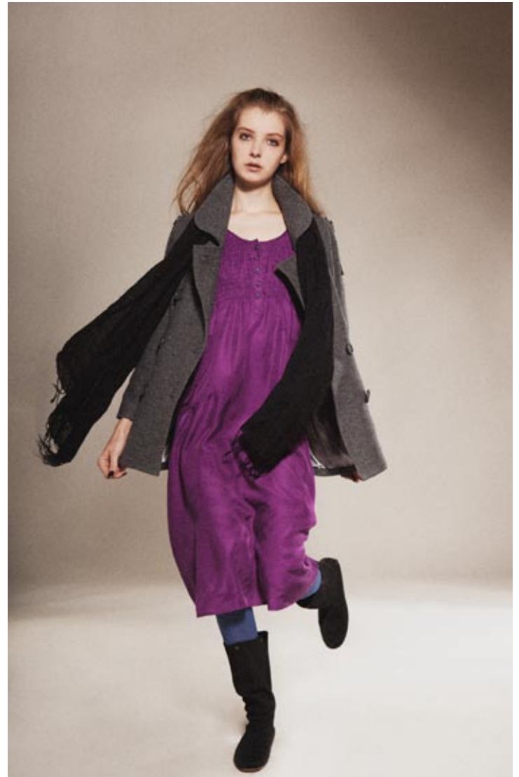
13 BOILED WOOL A-LINE PEACOCK, BAUHAUS SMOCKED DRESS, MOCCASIN BOOTS