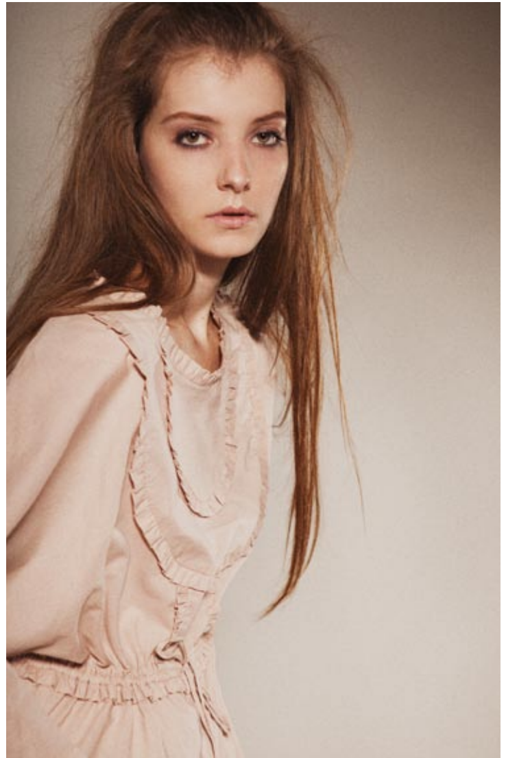
47 COTTON SILK VOILE RUFFLE NECKLACE TOP