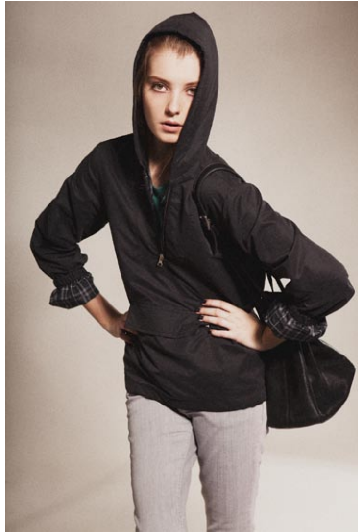
35 RIOT PULLOVER, STRETCH DENIM CIG JEANS