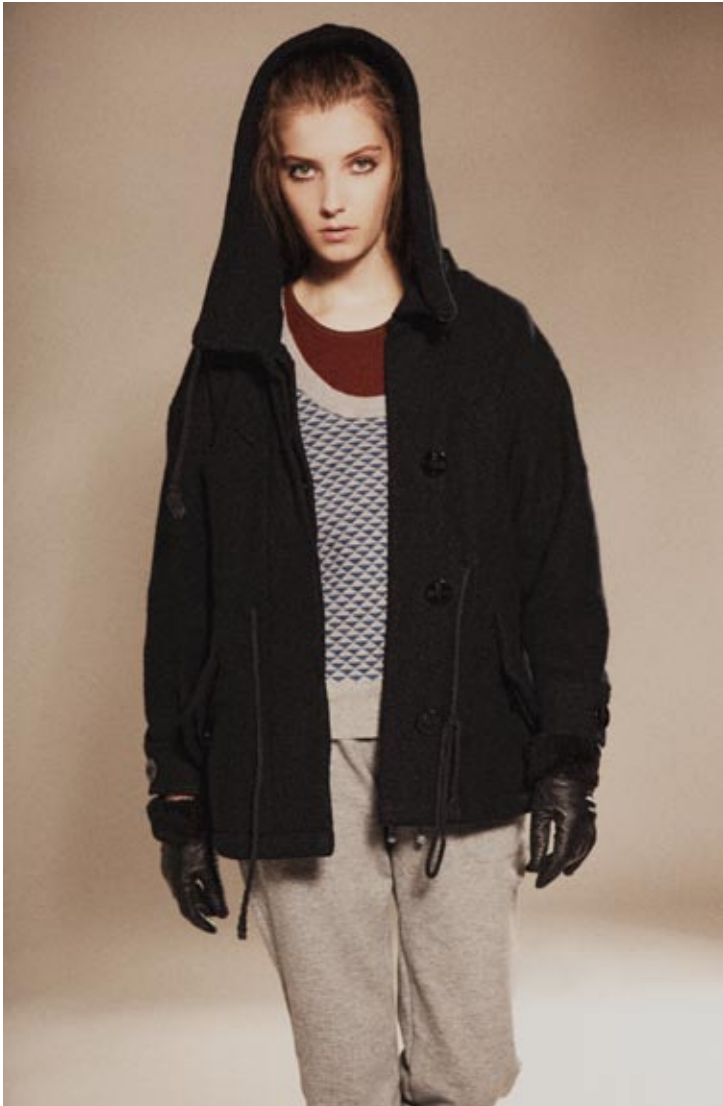
50 BOILED WOOL ANORAK, ALBERS JERSEY CREW TEE, INTERNATIONAL WOOL DIAMOND U NECK, SWEATPANTS