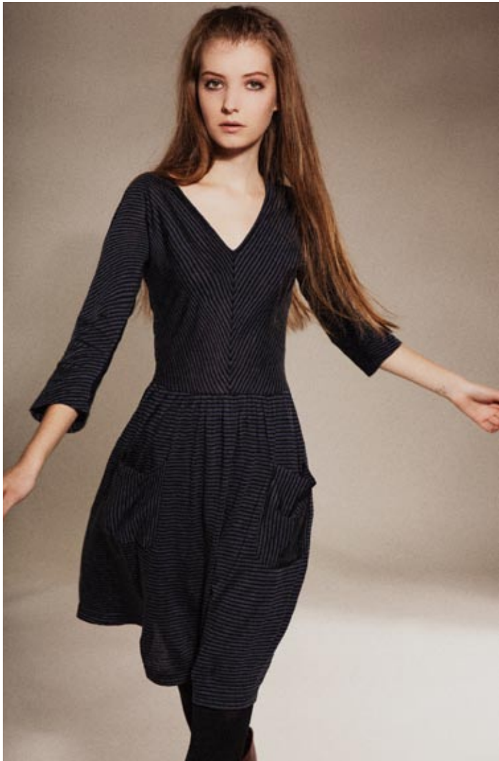
24 WEIMAR STRIPE V NECK DRESS