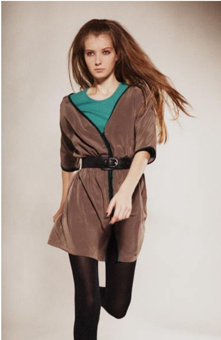
34 ALBERS JERSEY CREW TEE, MIES PIPED DRESS