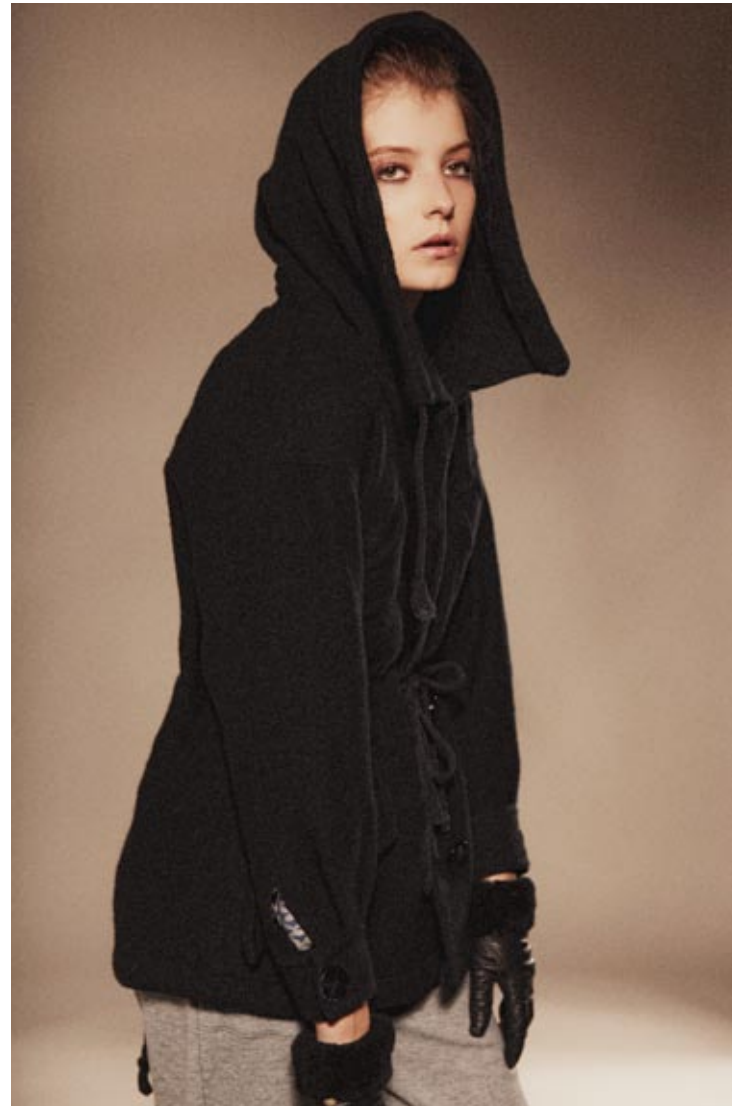
29 BOILED WOOL ANORAK, SWEATPANTS