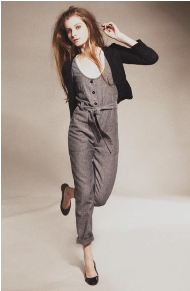
36 MOHAIR CARDIGAN, HERRINGBONE WOOL ONE PIECE