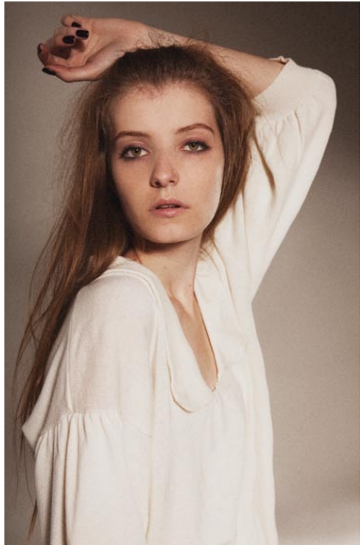
23 POET CASHMERE PETER PAN