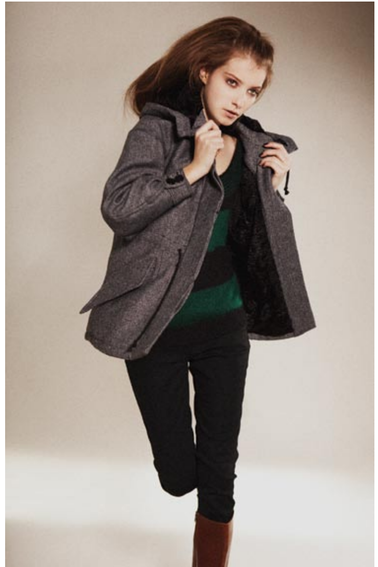
39 FLECK FUR TRIM ANORAK, MOHAIR STRIPED U NECK, STRETCH DENIM CIG JEANS