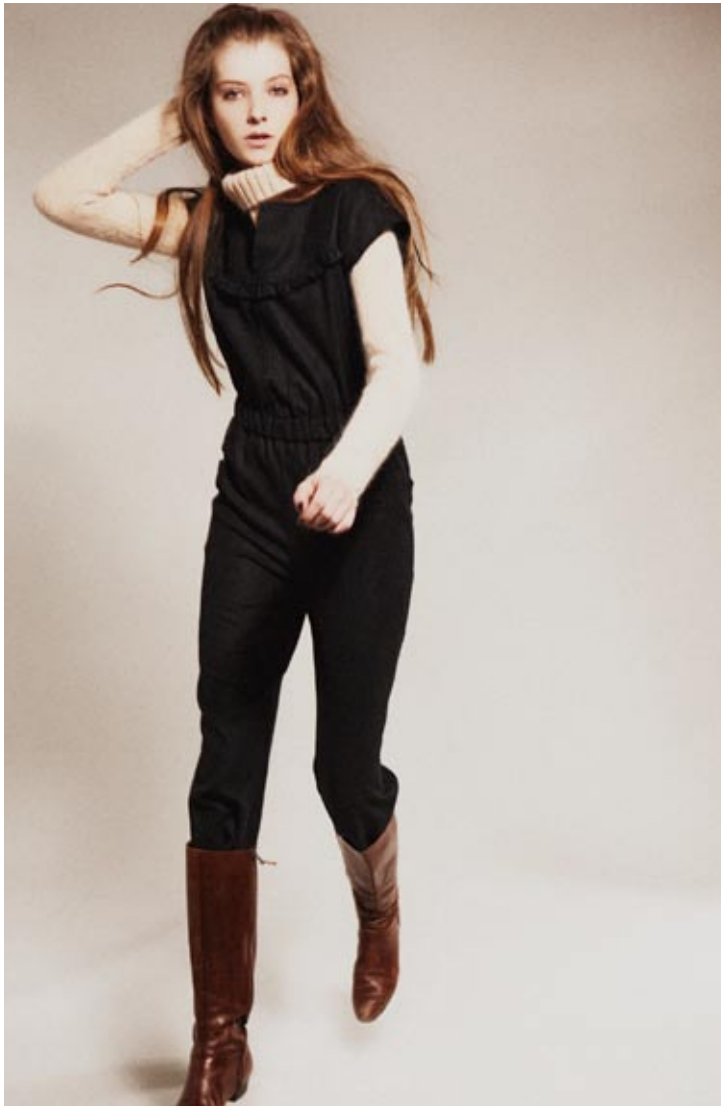
48 MOHAIR COWLNECK, WOOL GABARDINE JUMPSUIT