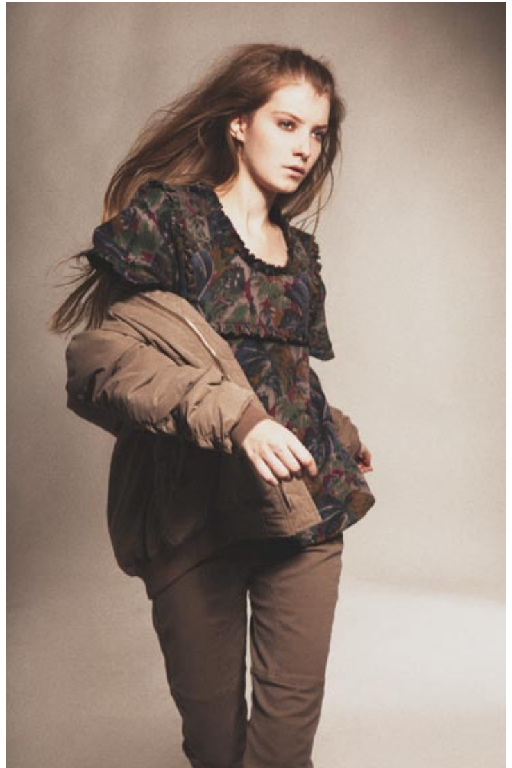
21 RIOT BOMBER, KLEE FLORAL LOOSE TOP, INDUSTRIAL CLOTH ARMY PANTS