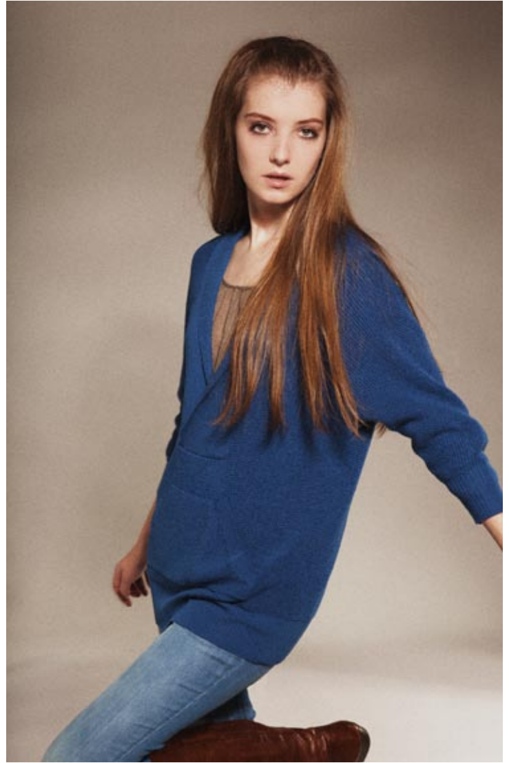
03 WAFFLEKNIT SHAWLNECK, WOOL VOILE SCOOP TOP, STRETCH DENIM CIG JEANS