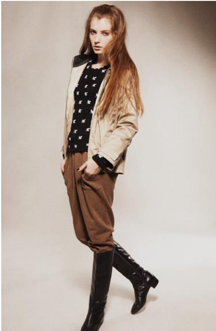
28 OVERCAST PARKA, STUDENT WOOL FLORAL EMBROIDERED CREW, SWEATPANTS