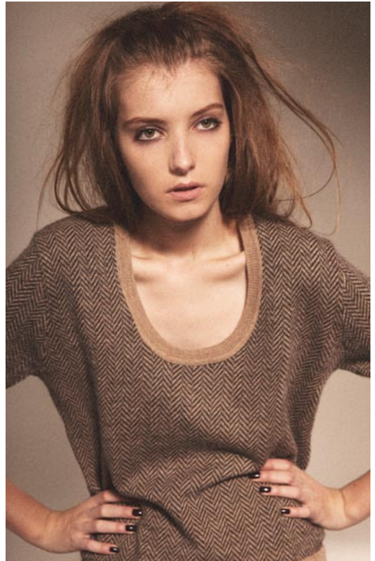
27 HERRINGBONE LOOSE U