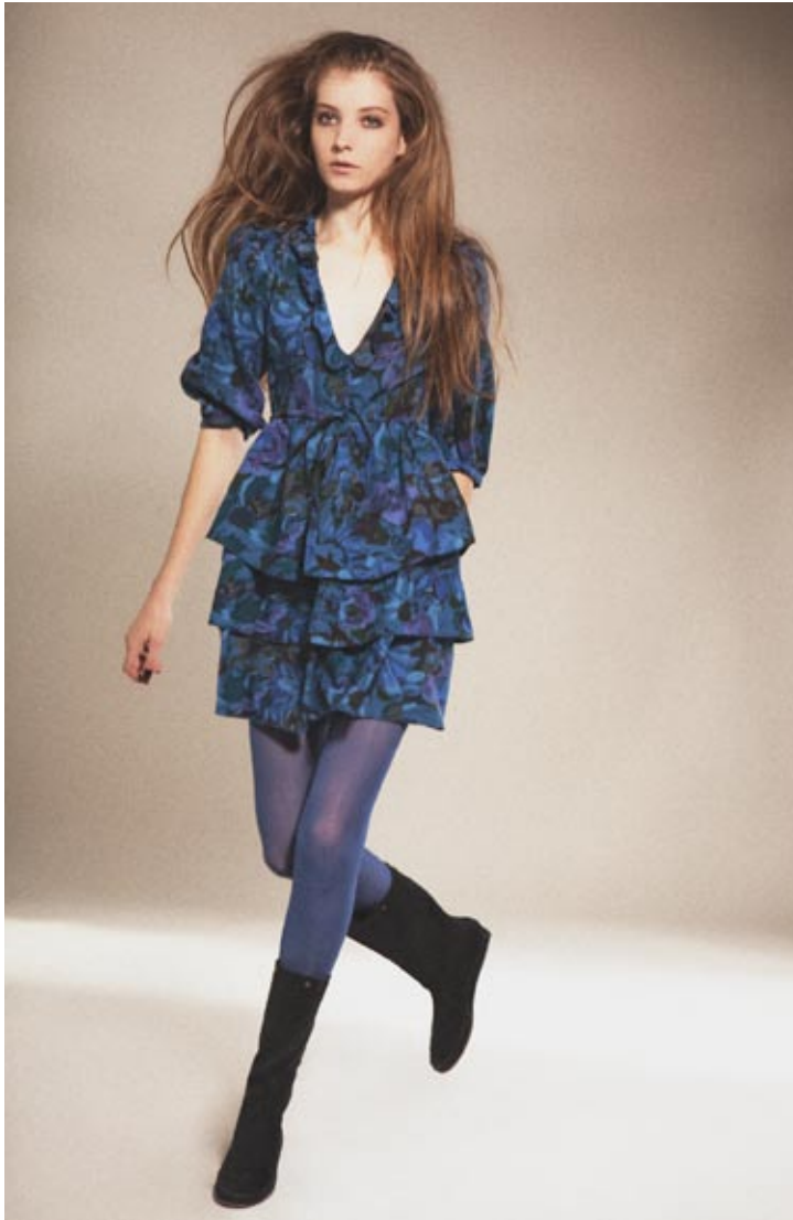
06 KLEE FLORAL RUFFLE DRESS, MOCCASIN BOOTS