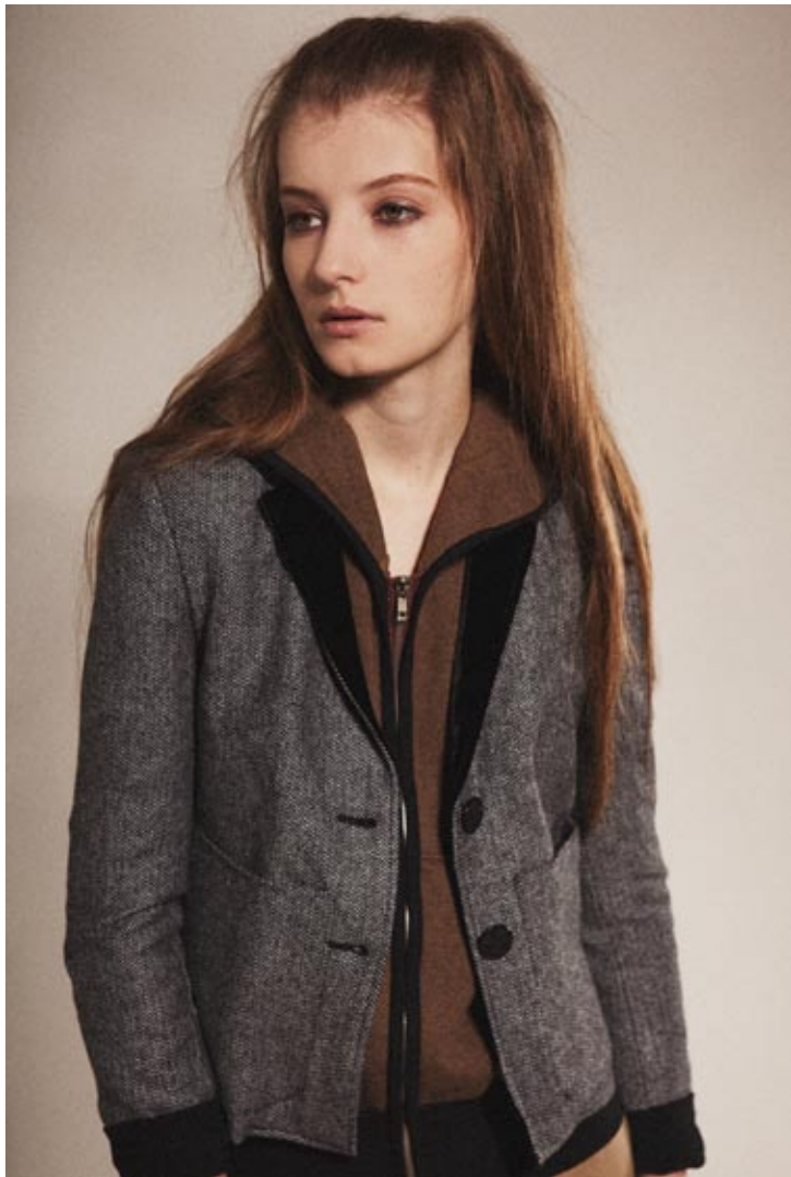
44 HERRINGBONE WOOL SPORTJACKET, HOODIE