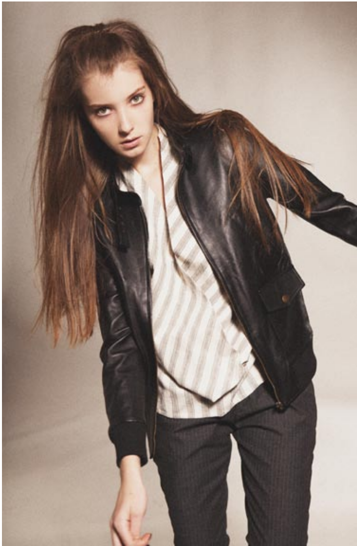
32 LEATHER, ORTHODOX STRIPE COWL BACK TOP, PROLETARIAT PINSTRIPE SLACKS