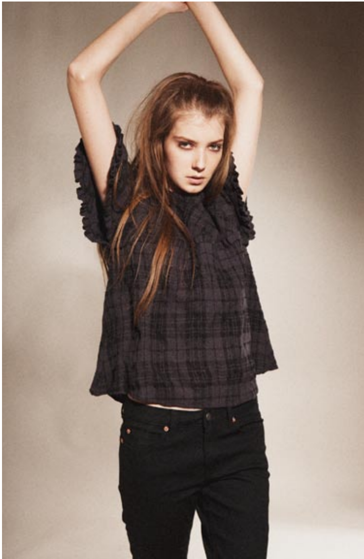
12 PLAID VOILE LOOSE TOP, STRETCH DENIM CIG JEANS