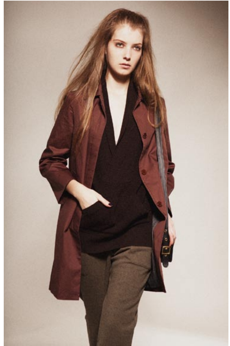
07 OVERCAST OVERCOAT, WAFFLEKNIT SHAWLNECK, SWEATPANTS