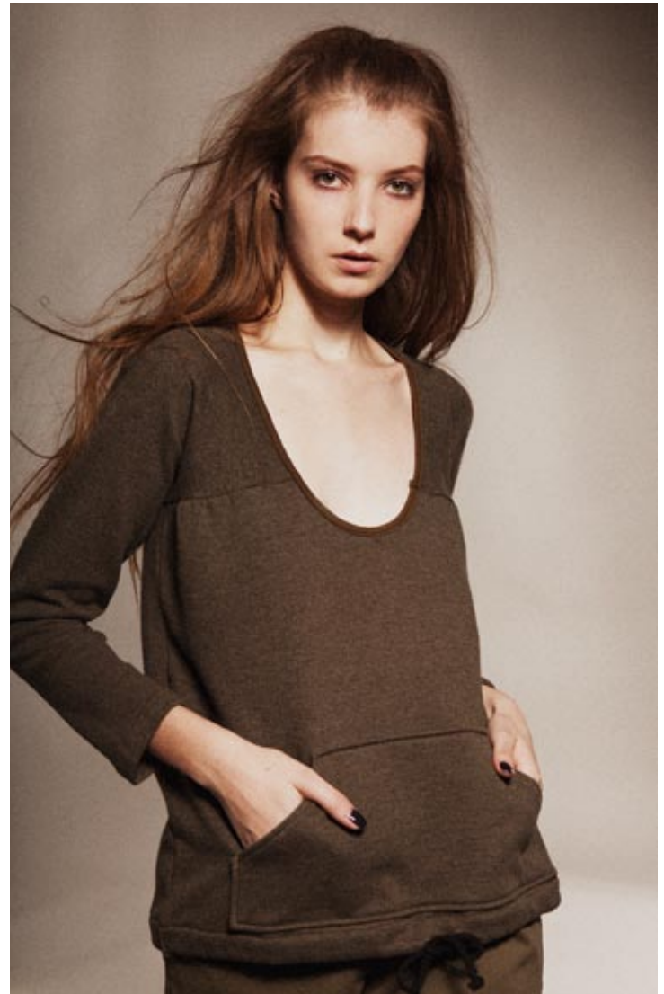
49 KANGAROO TOP