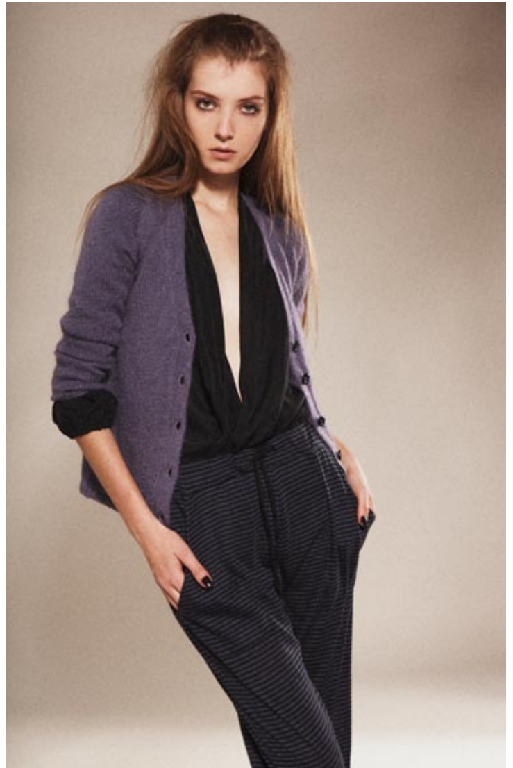
17 MOHAIR CARDIGAN, BAUHAUS COWL BACK TOP, WEIMAR STRIPE SWEATPANTS