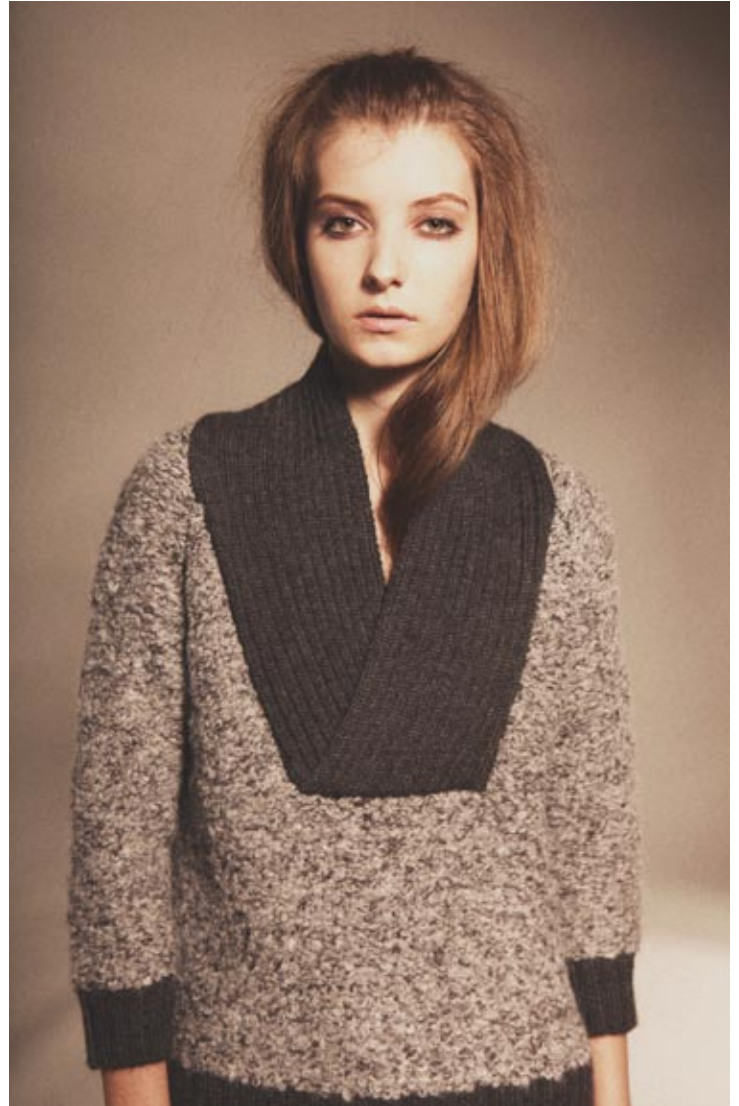
31 BOUCLE PULLOVER