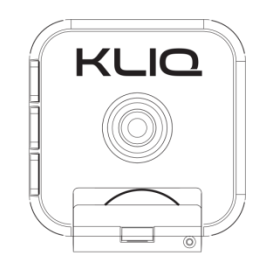
3. CLOSE BATTERY DRAWER