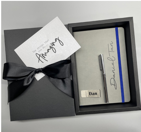
Journal Gift Set - Staff Appreciation Gift

Here are some readily available gifts. Click HERE to view more gift bundles on our website.