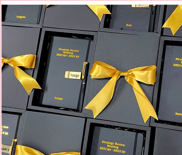
Personalised notebook featuring name of event for each participant to use during discussion at their meeting.