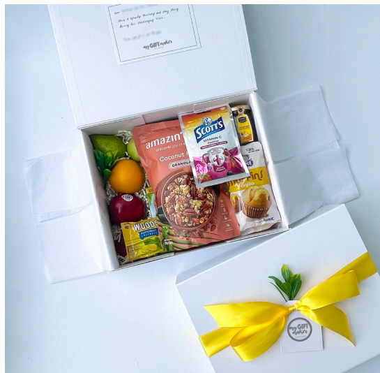
Gift tag and branded notecard on gift box

If you require gifts to be delivered to your staff on-demand (same day or next day delivery), we are here to save you from the hassle! In the next page, we feature some of our gift sets that are readily available on our website for instant purchase. You can even have your branding/logo customised on the notecard, gift tag, sticker or personalised with your recipient's name in a short turnaround time! If you would like to engage us for your regular staff/client gifting needs, contact us through email or phone. We'd be happy to answer any queries you may have!