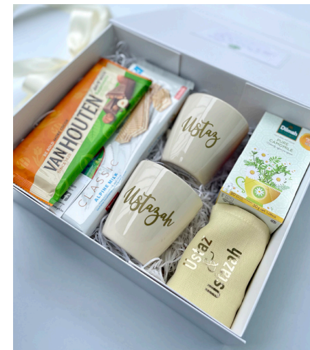
Items personalised with recipient's name using high quality iron-on vinyl or sticker vinyl.