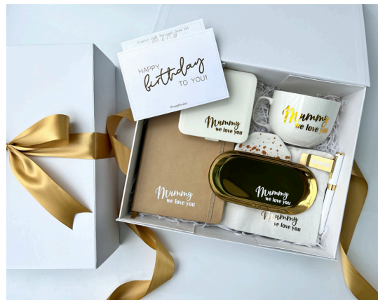
Premier Luxe Personal Desk Set - Congratulatory Promotion Gift