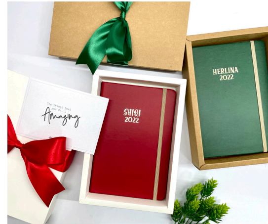
Imprinted Personalised Notebook complete with Gift Box - Year-end Corporate Gifts