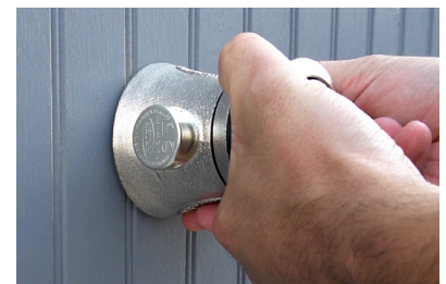
Step 5: Vacuum breaker is at the 9 o'clock position, and the spout is at 3 o'clock