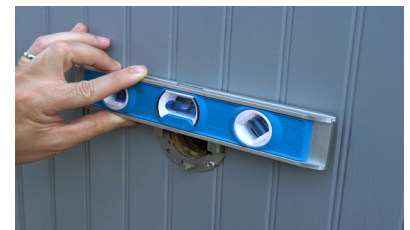
Ensure mounting bracket is level