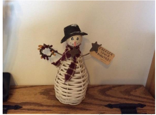
Snowman same pattern, brought in at bottom and painted white.