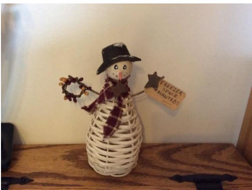
Snowman same pattern, brought in at bottom and painted white.