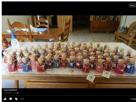
And an entire host of angels sang Hallelujah!