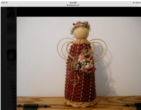
One of Lara's larger angels.