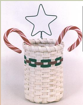
Candy Cane Basket GH Productions Inc. Shared by Basket Makers Catalog