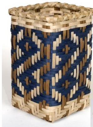
"Cherokee Pipes" and "Double Wall Apple Basket" by Kathy Tessler