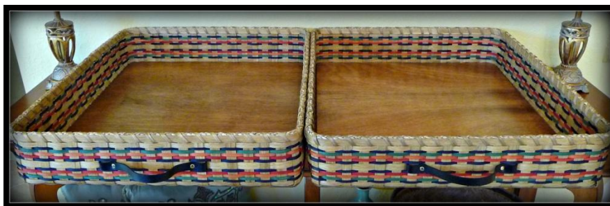
The basket shown in top picture ended up with a twin and here they are finished.

Did you come up with a unique weaving concept or an innovative technique that you would like to share? Email it to me and it might just be included in next month's newsletter. Include a picture or link to make it more interesting.