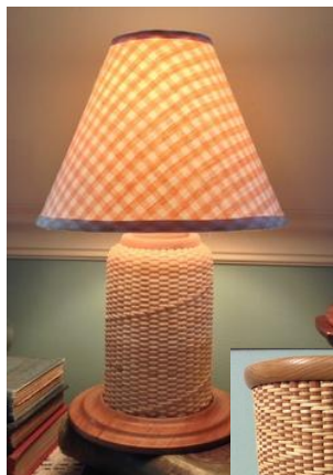
"Nantucket Lamp" and "Nantucket Wastebasket" by Shirley Mount

Here are photos of some of the class projects that will be available during the weekend workshop.