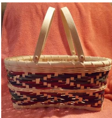
"Push Me - Pull You II" ↑ by Sue Tucker