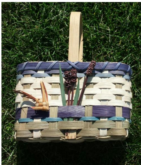
"Fancy Wrapped Handles" → by Sue Little