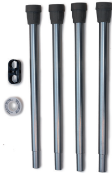
LEG EXTENSION KIT