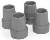
HEAVY DUTY RUBBER FEET