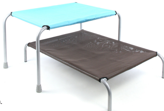
BUNK LEGS above standard bed

Size one will extend the height of your bed by 32cm. Size two will extend the height of your bed by 42cm.